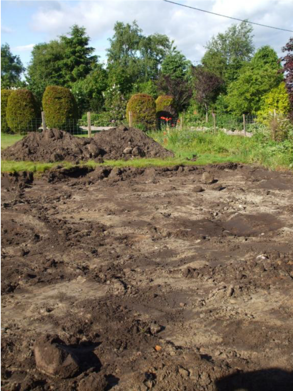
Ill 4: The soil strip (facing south)