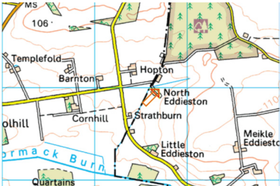
Ill 1: Site location