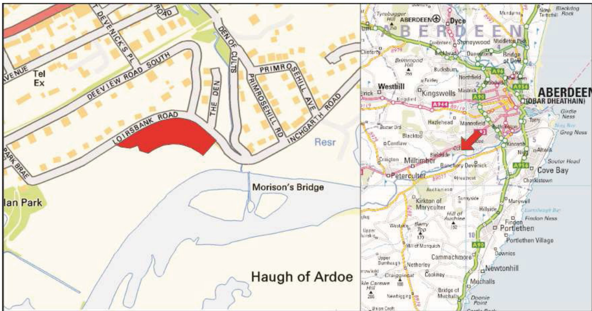
Ill 1 Location plan (Contains Ordnance Survey data © Crown copyright and database right 2010)

The site lies south of Loirsbank Road at its east end junction with Deeview Road South (Ill 1). It is located in the Dee river valley, on north side of the river at 15-20m above sea level. It lies on the opposite side of the river from the Haugh of Ardoe. The area of the development is approximately 8212m 2 (Ill 2).