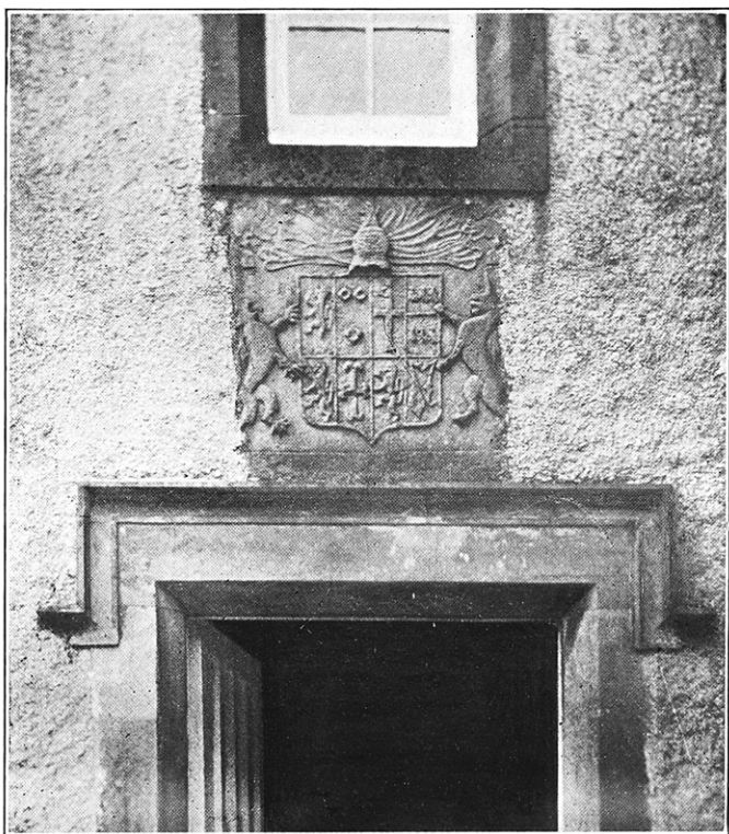
THE PICKERING SHIELD OF ARMS ; Crosby Ravensworth Hall.