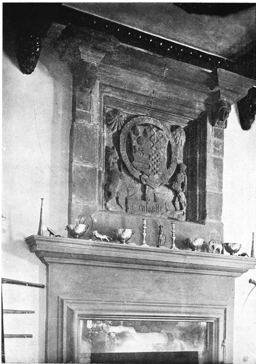
THE COLLEGE, KIRKOSWALD ; Dacre arms in the Hall.