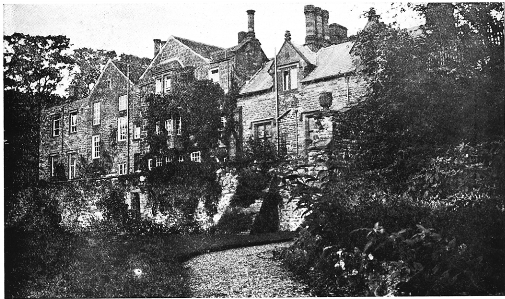
THE COLLEGE, KIRKOSWALD ; West Front.