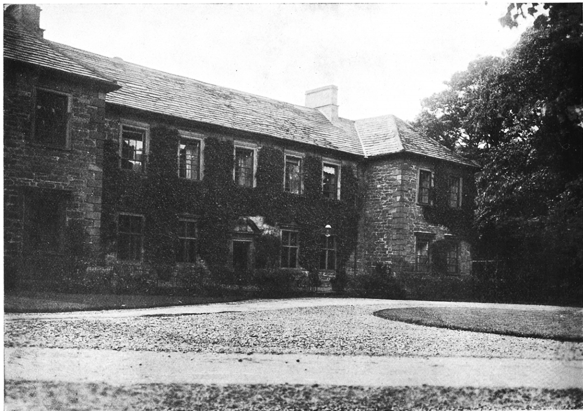
tcwaas 002 1914 voll4 0010 THE COLLEGE, KIRKOSWALD ; East Front.