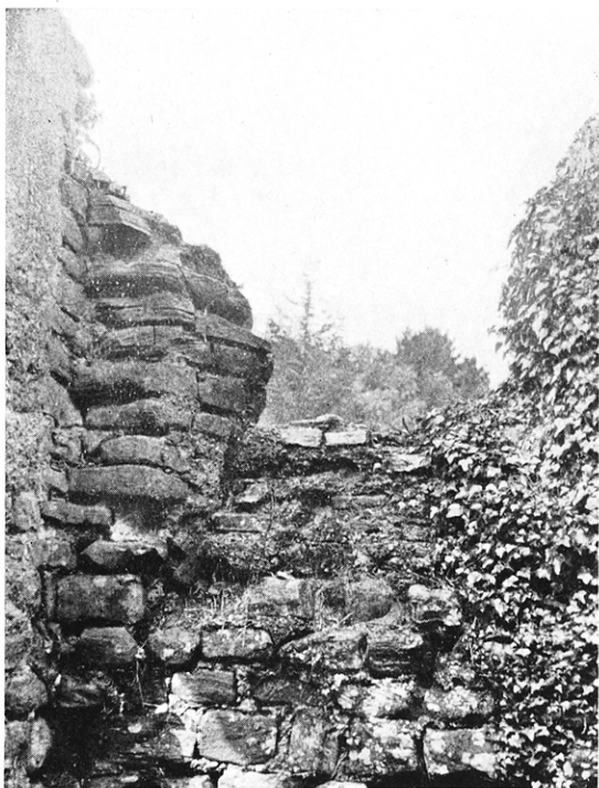
Plate IV, B.—“Walls Castle” Window from inside, showing subsequent blocking.