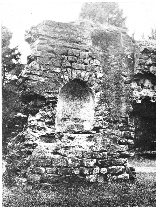
Plate IV, A.—“ Walls Castle ”—Niche.