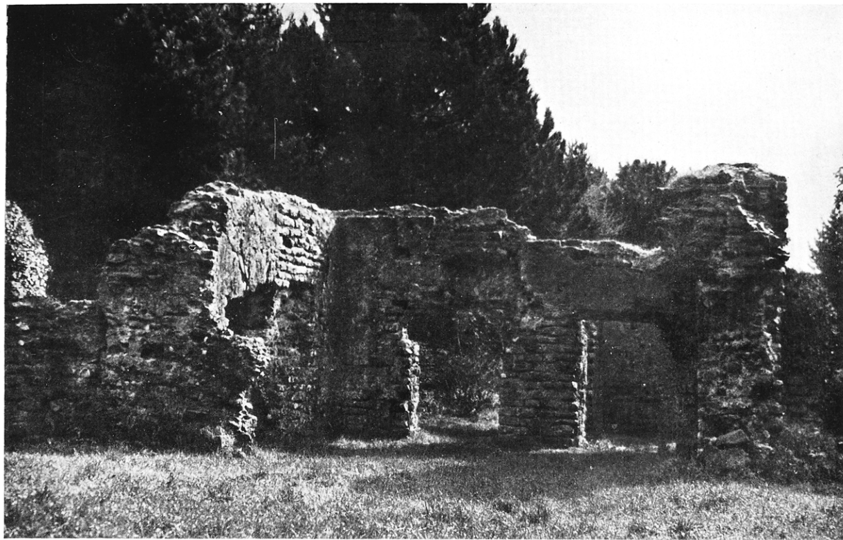
Plate I.—“Walls Castle,” General View from the North.