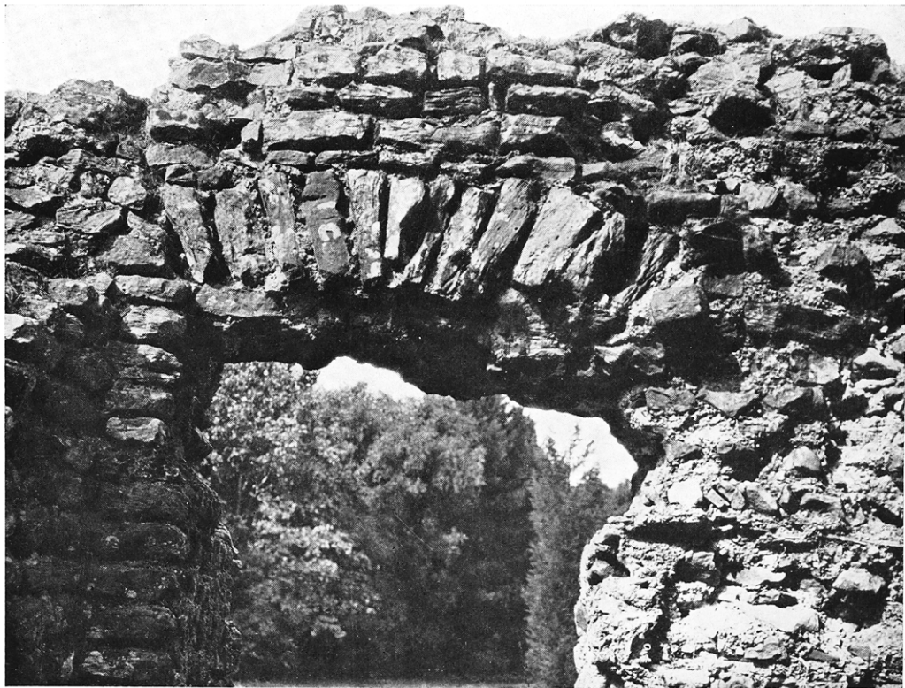
Plate II. "Walls Castle"—Flat relieving arch above lintel (removed) of doorway.