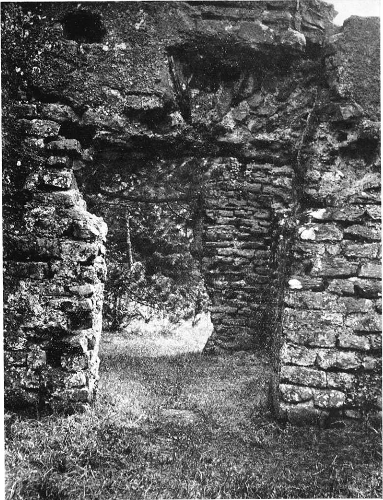
Plate III, "Walls Castle"—Doorway, showing relieving arch above removed lintel and wall-face rendered in pink cement.