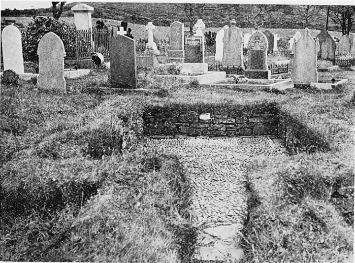
FOUNDATIONS OF KEEILL, MAUGHOLD CHURCHYARD