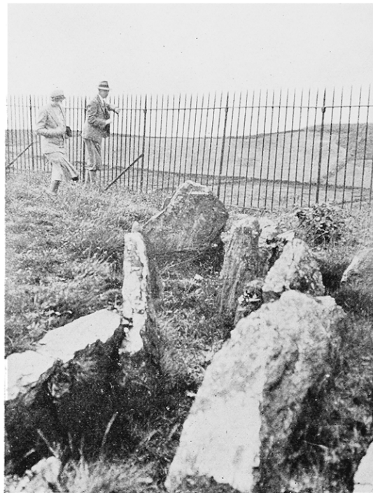
MULL HILL CIRCLE