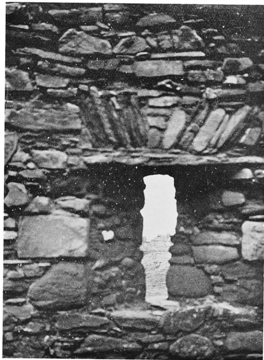
WINDOW, "THE ARMOURY," PEEL