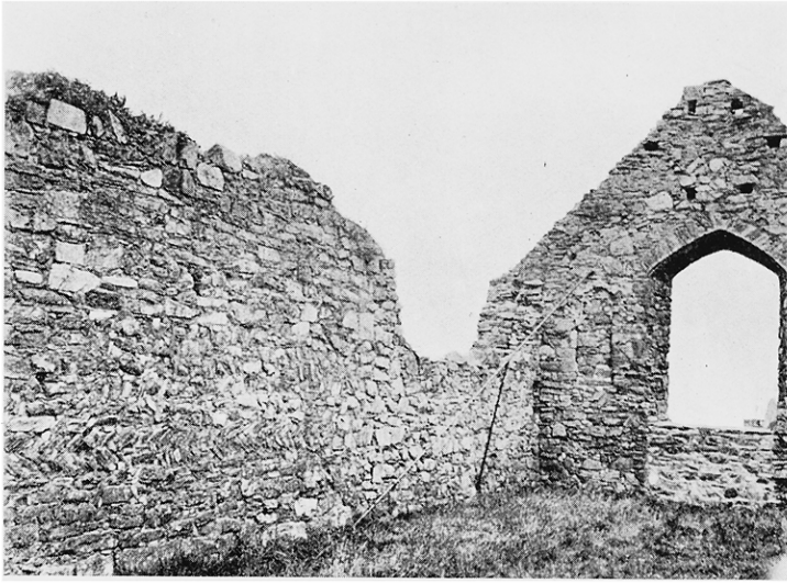
ST. PATRICK'S CHURCH, PEEL (showing herring-bone masonry)