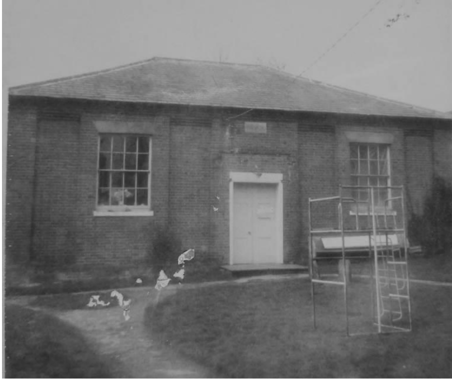
Figure 2: Undated (post-1975) photo of the front (east) elevation