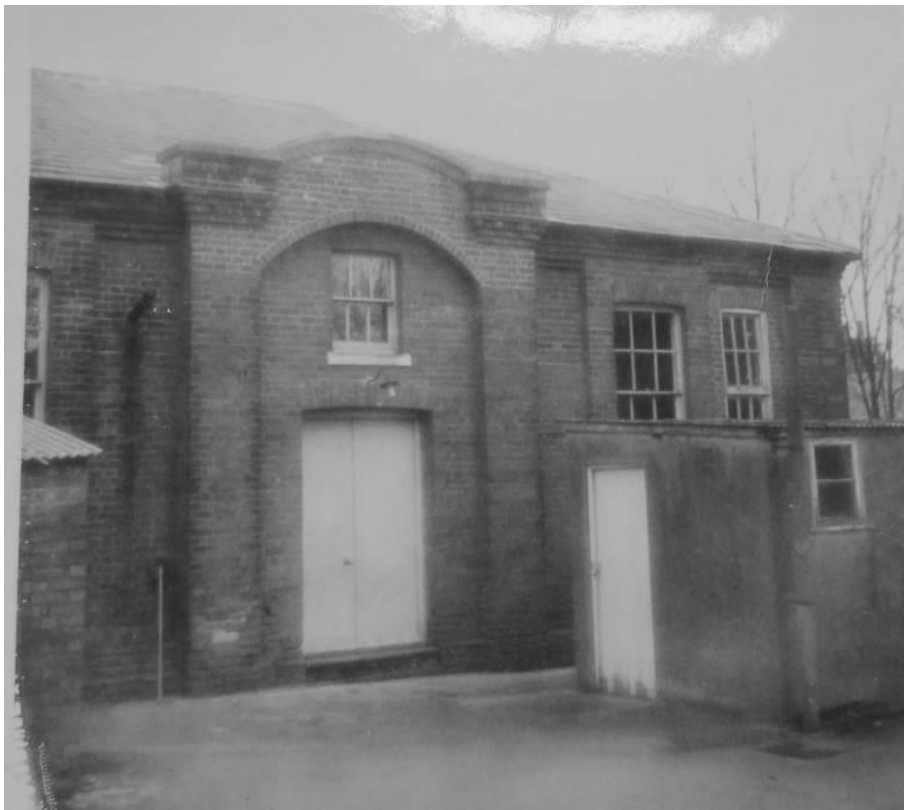
Figure 3: Undated photo of the rear (west) elevation before the 1993 extension