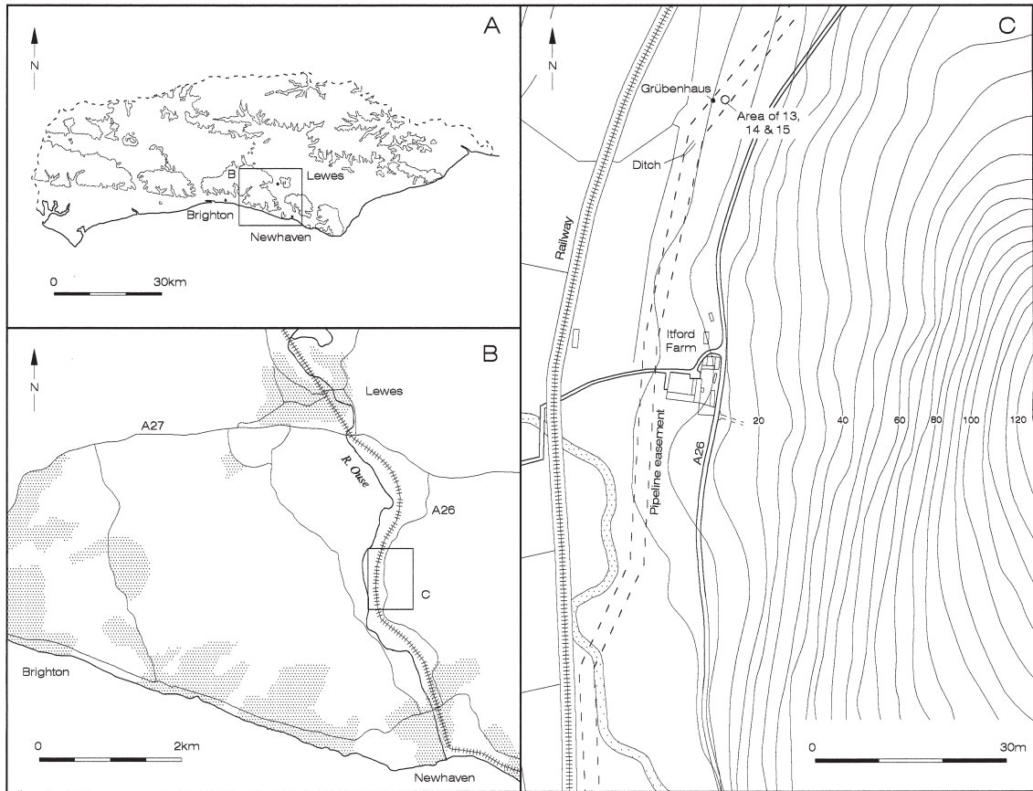
Fig. 1. Site location plan.

western side of the feature. The proximity of the spoilheap and the less obvious edge on this side made it difficult to establish the true centreline of the feature at this point. An additional box extension to the quadrant succeeded in locating the post-hole (Context 7), which was slightly larger and deeper (580 mm) than that to the east (Context 9). The bedrock in this quadrant was found to be more irregular, with the southern edge forming a rough platform. No edge was present at all on the short western side, just an irregular ramp of chalk, although the bedrock had been quarried away around the mouth of the post-hole. The visual effect of this suggested that the feature had been terraced into the slope, an observation confirmed by the levels.