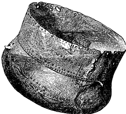
Fig. 1.—Caldron found in Carlingwark Loch.

Large Caldron, formed of very thin plates of yellow bronze, the bottom being formed of one large sheet, and the sides of various smaller portions, all riveted together. It is patched in various places with additional bronze plates of various sizes riveted on. The caldron measures