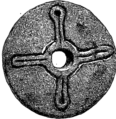
Upper Stone of Quern found near Stranraer (18 inches diameter).

ornamented on the upper surface by an incised equal-armed cross, the arms of which extend 6 inches on either side of the central aperture. Such