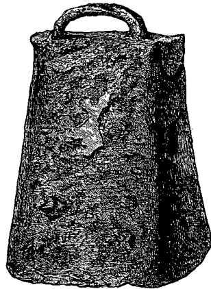
Fig. 2. The Bell of Kingoldrum.