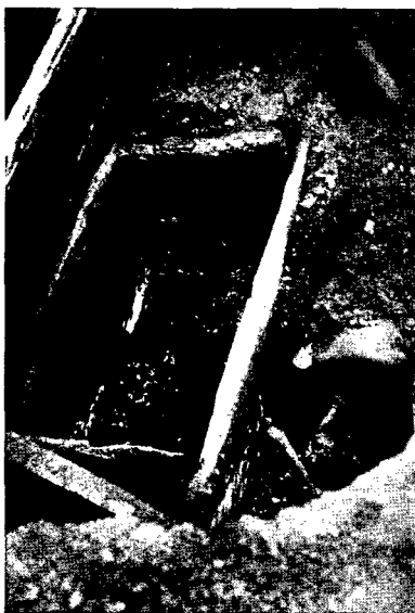
Fig. 1. Cists in Holm, Orkney.

flagstones in the usual way, but the covering arrangements are such as to make it one of the most interesting so far discovered.