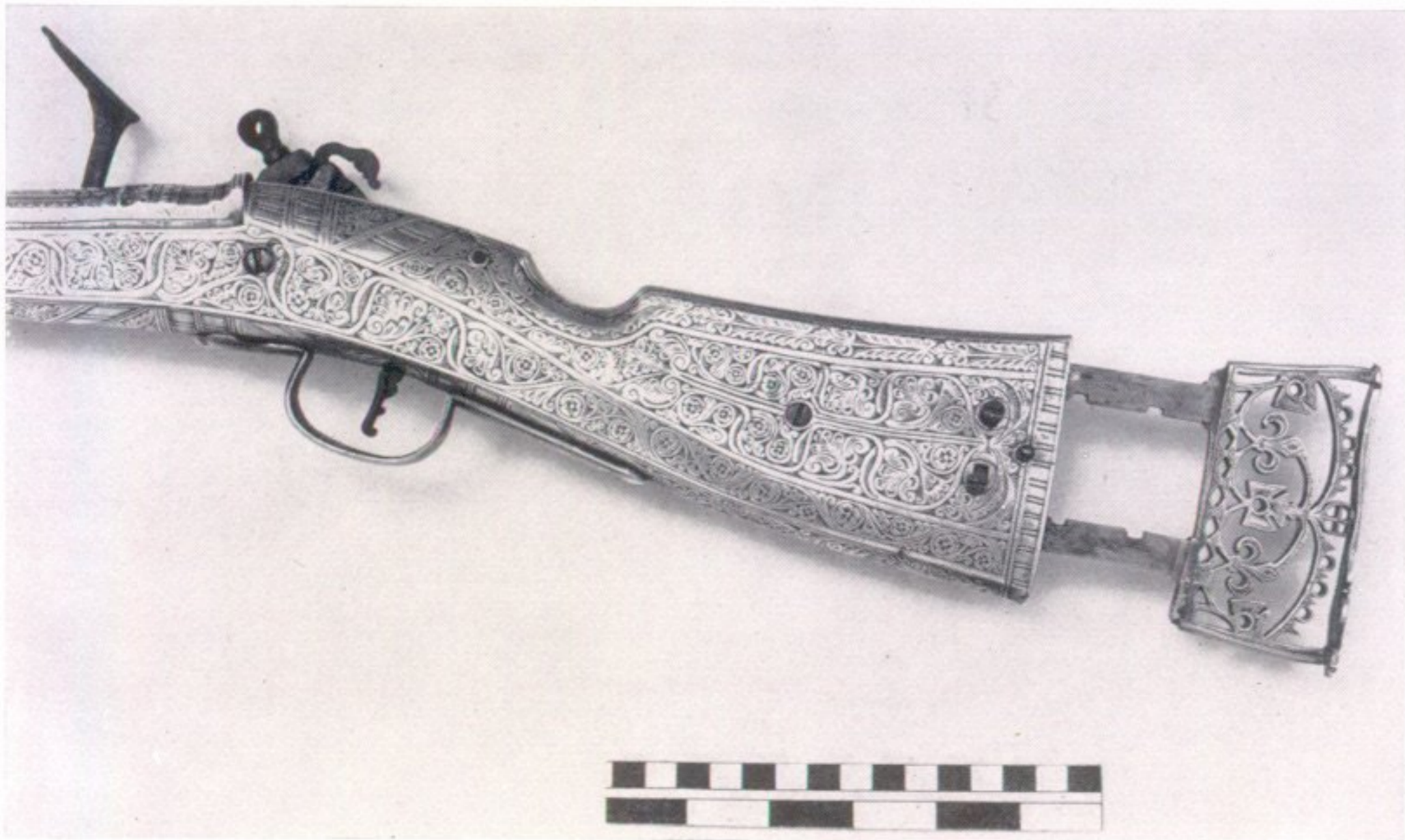
b Butt extended