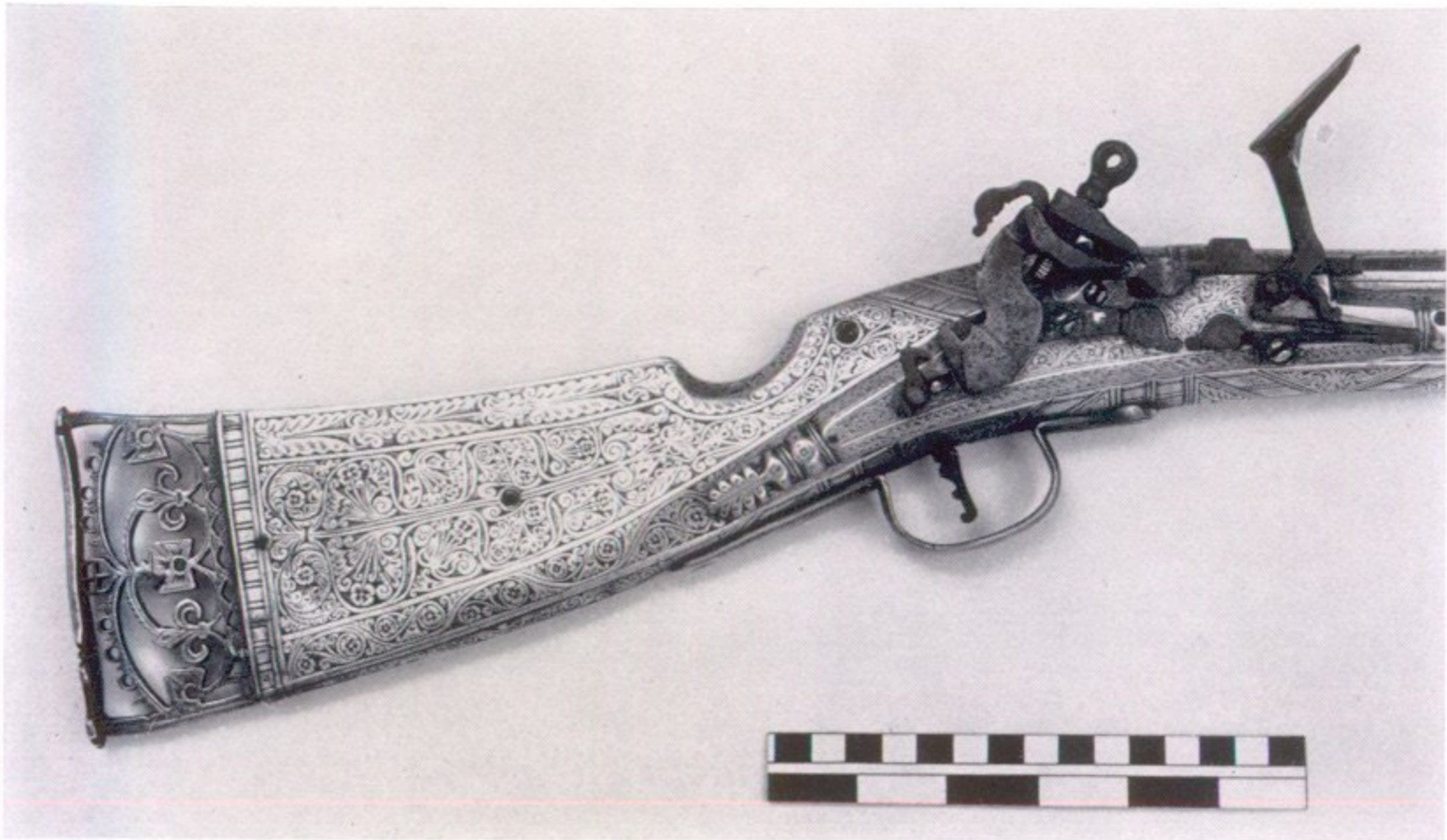
a Detail of butt and lock-plate