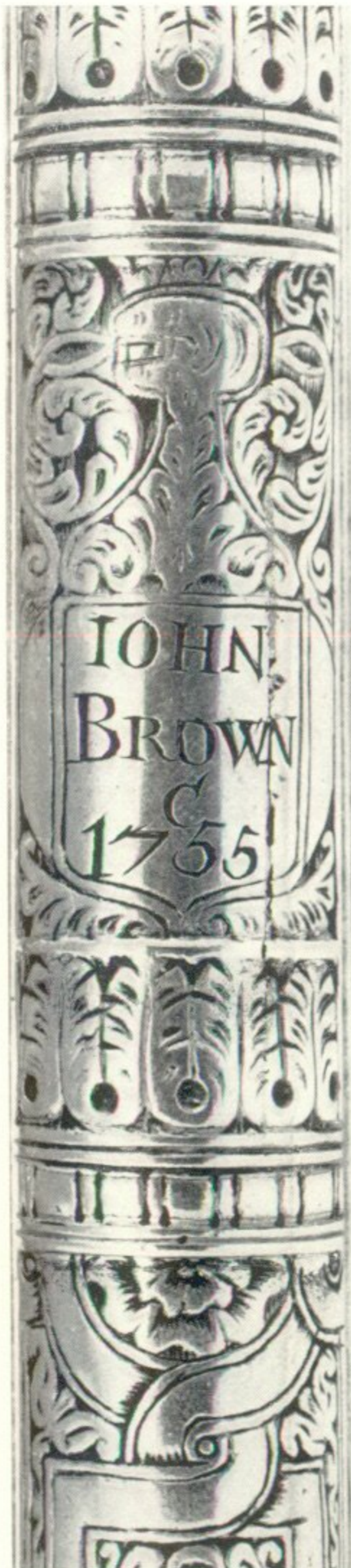
b Barrel detail