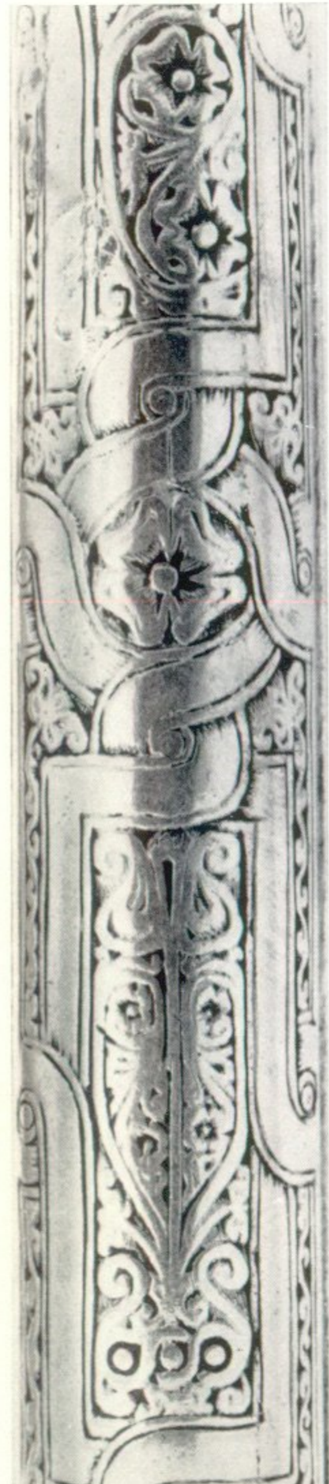
c Barrel detail