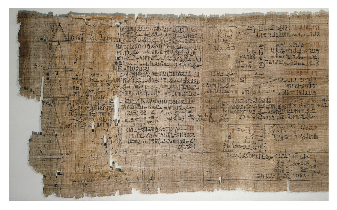
ILLUS 2 The Rhind Mathematical Papyrus (EA 10057-8). Reproduced by kind permission of the Trustees of the British Museum

perhaps somewhat ironic that, in this case, Rhind obtained his papyrus in the very manner of which he deplored, ie plundered tomb relics being sold on for profit; however, his purchase saved the text from perhaps being lost or disappearing into a private collection. As previously mentioned, he intended to buy, where possible, artefacts to supplement what his own excavations were lacking (Stuart 1864: 12).