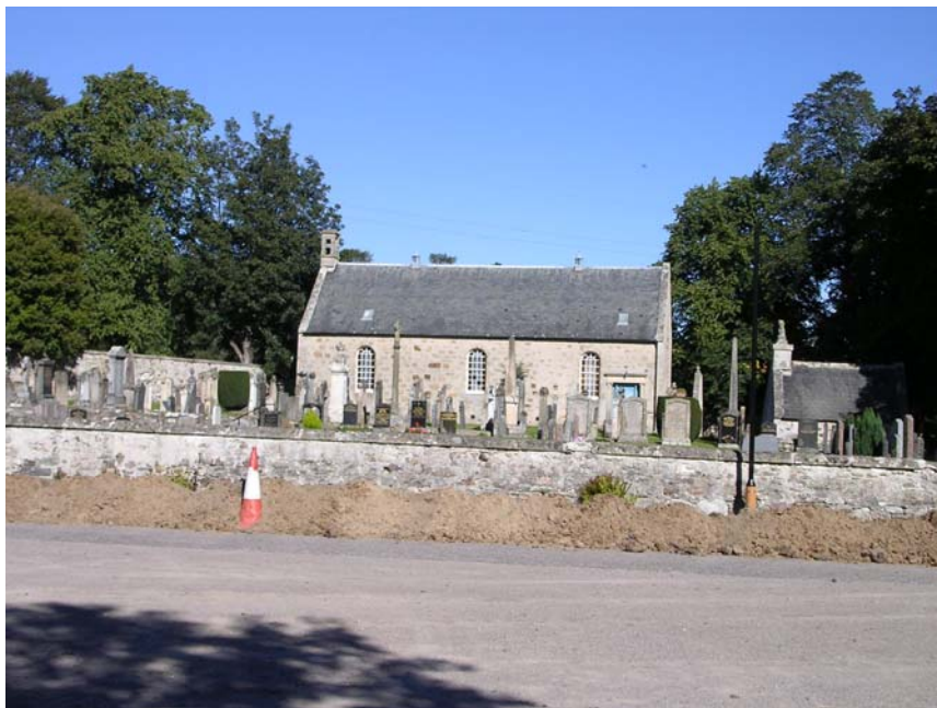
Figure 3 View north across trench to church and churchyard from [1]