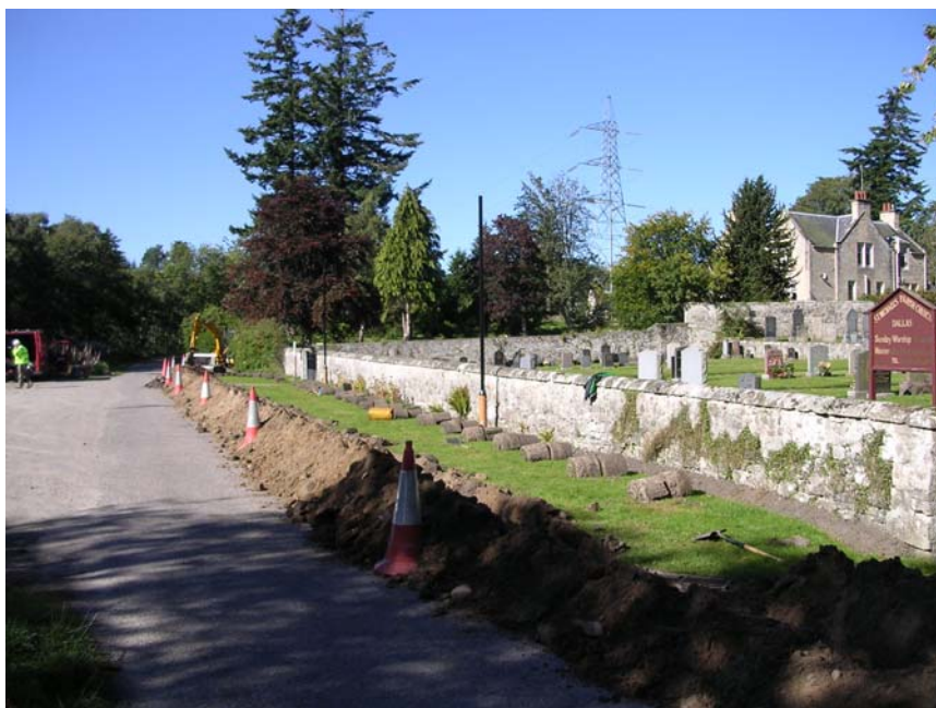
Figure 4 View west along trench from [2]