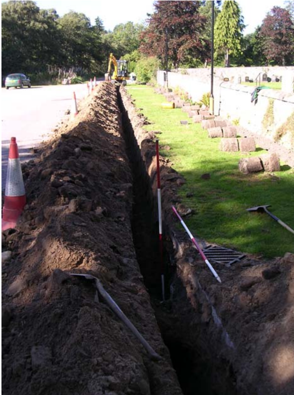
Figure 8 View west from path entrance and disturbed area along trench from [2]