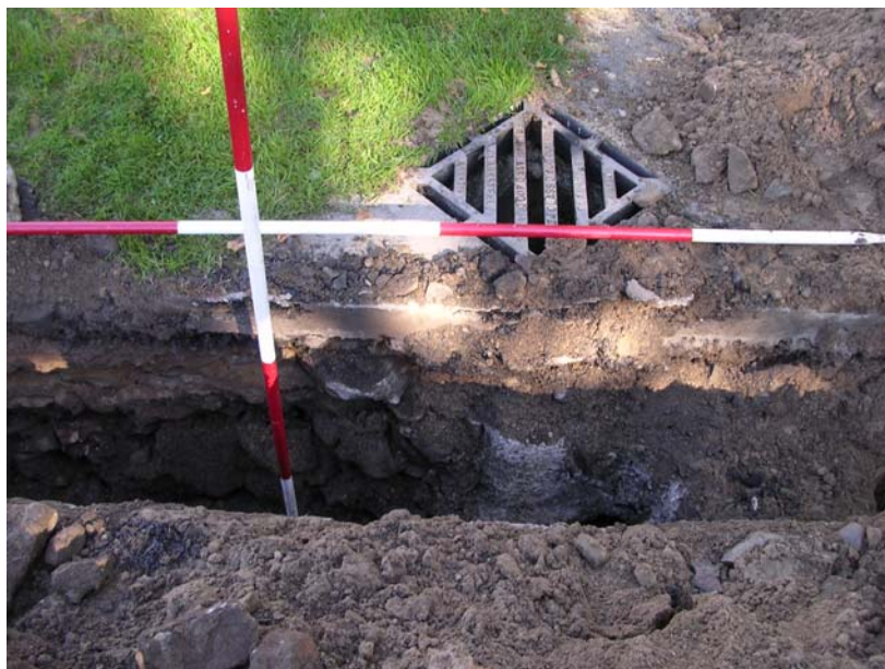
Figure 5 Disturbance for modern drain and manhole from [2]