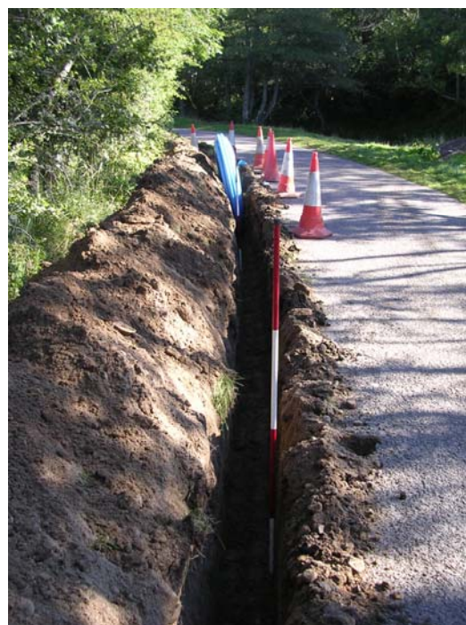
Figure 7 View east from churchyard corner from [2]