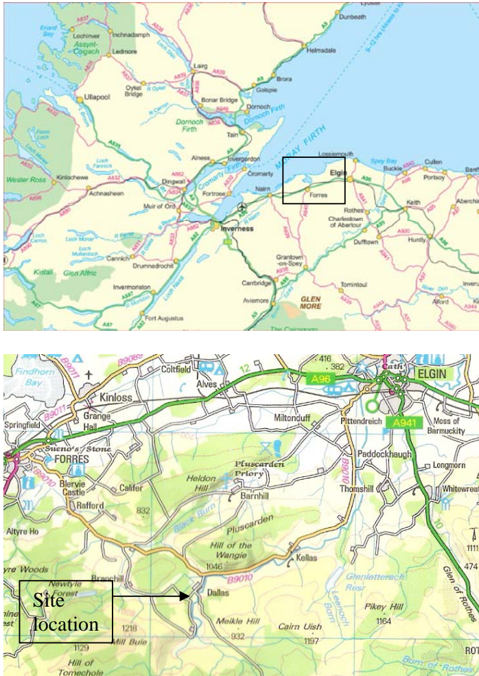
Figure 1: Site Location.

Reproduced from Ordnance Survey map data by permission of Ordnance Survey, © Crown copyright. Licence No. 100043217