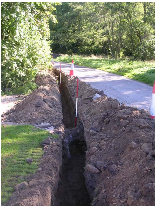
Figure 6 View east showing drain and manhole at path junction from [3]