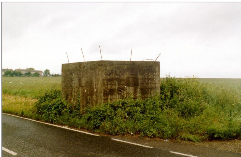
Fig. 3. - UORN 440: type 22 pillbox at the edge of the road, once part of the southern perimeter defences of the main transmitter site.

At Site 1, in the period 1999-2000, three pillboxes were regrettably destroyed by the local farmer because they obstructed the enormous field stretching to the river that has now been created there. However, two type 22 pillboxes survive, one at the very edge of the road [UORN 440] and another behind the village hall [UORN 439]. Another pillbox that may possibly survive, UORN 437, could not be located during fieldwork.