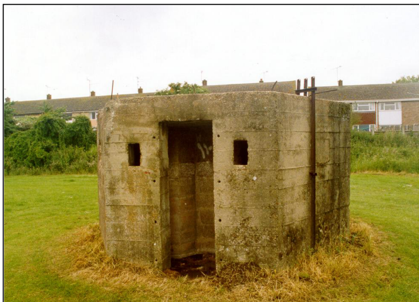
Fig. 4 - UORN 439: type 22 pillbox now standing behind the Canewdon village hall.