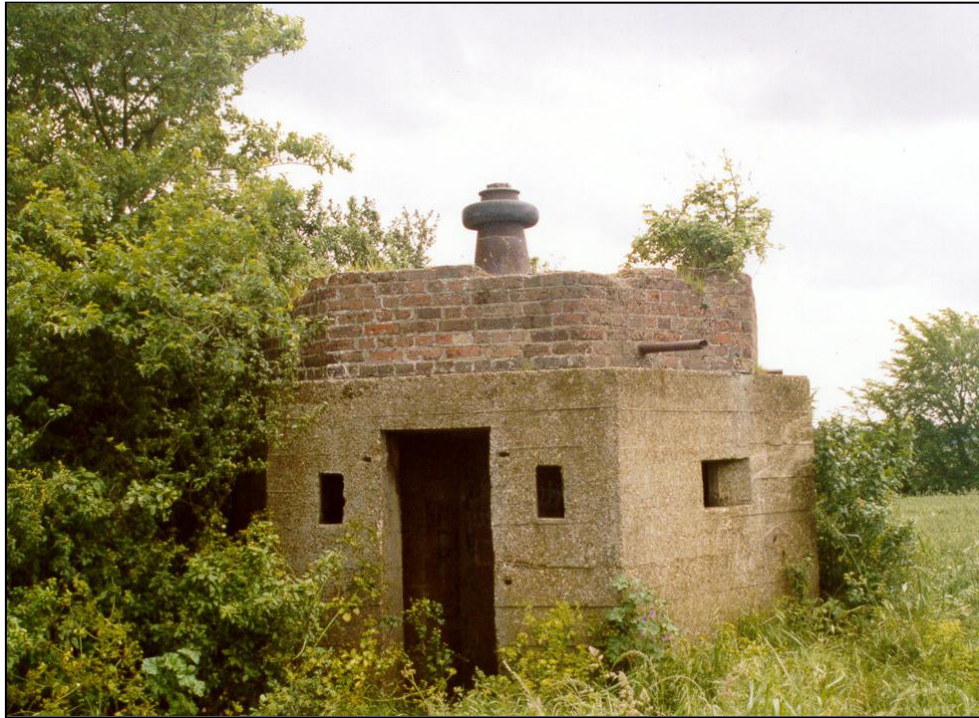
Fig. 5 - UORN 13637: type 22 pillbox variant, with a brick-walled anti-aircraft platform on the roof. The AA gun mounting has long since been removed, and has been replaced today by a traffic cone! The hexagonal shape of the addition is not in conformity with that of the pillbox structure it is built upon.

At Site 2, there is no access to the surviving compound and its buildings. However, one pillbox associated with this site, heavily overgrown, can be seen at the edge of the lane [UORN 16084], and two others can be viewed at a distance [UORNs 16083 and 16139]. A little to the west of the site, and presumably part of its defences, stands an unusual defence structure where a brick addition has been added to the roof of a concrete type 22 pillbox presumably to mount an anti-aircraft gun [UORN 13637].