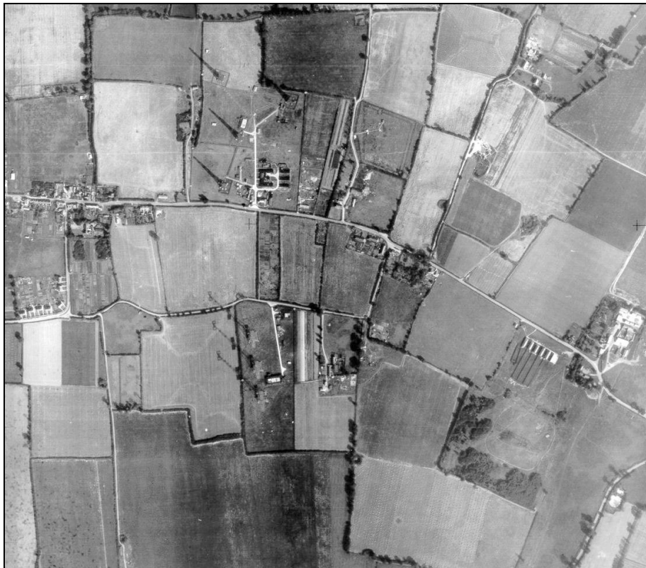
Fig. 2 - Aerial photograph taken in 1948 showing the three sites of RAF Canewdon. The main transmitter site can be seen at the top with the shadows of its four masts, and the receiver site towards the bottom, with three masts showing: this site remains substantially intact. The third site lies at the bottom right, and appears by this date to have been dismantled. Both the latter site, and the main site, are now open fields.

RAF Canewdon was established at three separate sites [see Map 2]. No.1 was the main transmitter site with four masts, north of Lambourne Hall Road just to the east of Canewdon village. No. 2 was the receiver site with three masts, south of Gardener's Lane to the south of the village. No. 3 appears to have been an accommodation and stores site further to the east and south of Lambourne Hall. Each of these sites had its own defences, of which a number of the pillboxes survive.