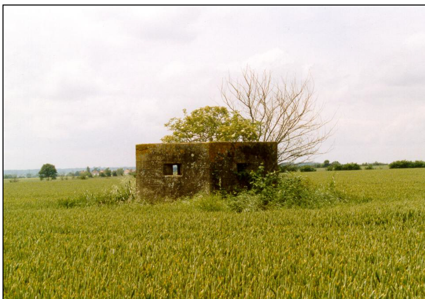
Fig. 6 - UORN 13634: this type 22 pillbox, standing now all alone, once defended the south-east corner of the easternmost of the three RAF Canewdon sites.

A single type 22 pillbox standing solitary today in a large open field marks the south-east corner of site no.3 which it once defended [UORN 13634]. No other defence works of this site survive.