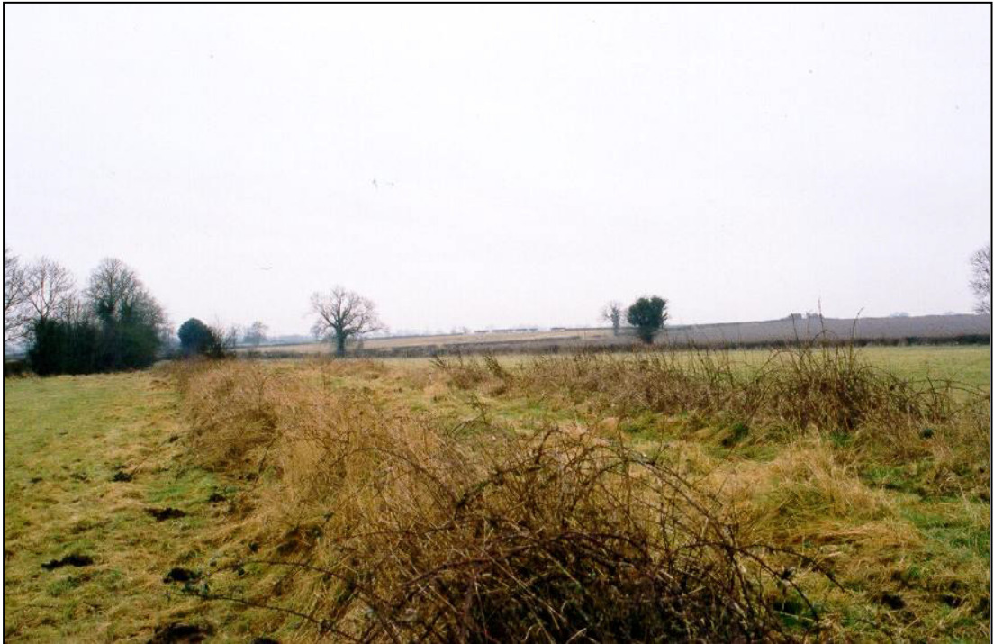
Fig. 2 - UORN 14403: length of anti-tank ditch showing on the ground as a substantial ridge used today by the local farmer as a trackway - an example of the change of use of an archaeological feature.

It is remarkable that a raised landscape feature has been created in this way out of an original excavated ditch, which might thus be said to survive but in a totally different form!