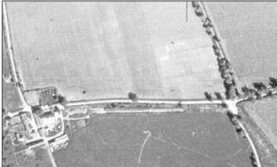
Fig. 4 - UORN 12508: the open length of anti-tank ditch seen in an air photograph taken in May 1947. Also to be made out in this photograph is the crop mark of a rectilinear feature north of the right hand crossroads. There is no known archaeological site at this location.

Pillbox, UORN 6846, stands at the edge of a steep-sided valley near to Avening. It is made with an outer surface of prefabricated concrete panels bolted into place, and has an attached brick entry porch that serves as well as an exterior blast wall. This is the form of all three surviving pillboxes within the defence area. UORN 6850 by Star Cottages appears in better condition, but is not accessible without permission. This pillbox was positioned forward of the anti-tank ditch, which is highly unusual. The third pillbox, UORN 6851, standing at the edge of the lane is badly overgrown, but its interior, to which there is now no access, appears to be excellently preserved.