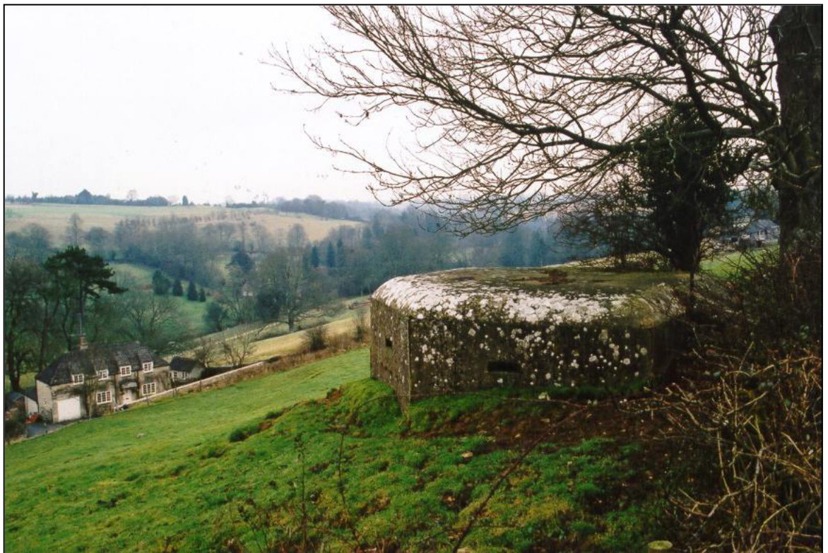
Fig. 5 - UORN 6846 - type 24 infantry pillbox overlooking the steep-sided valley that runs from the village of Avening.

Pillbox, UORN 6846, stands at the edge of a steep-sided valley near to Avening. It is made with an outer surface of prefabricated concrete panels bolted into place, and has an attached brick entry porch that serves as well as an exterior blast wall. This is the form of all three surviving pillboxes within the defence area. UORN 6850 by Star Cottages appears in better condition, but is not accessible without permission. This pillbox was positioned forward of the anti-tank ditch, which is highly unusual. The third pillbox, UORN 6851, standing at the edge of the lane is badly overgrown, but its interior, to which there is now no access, appears to be excellently preserved.