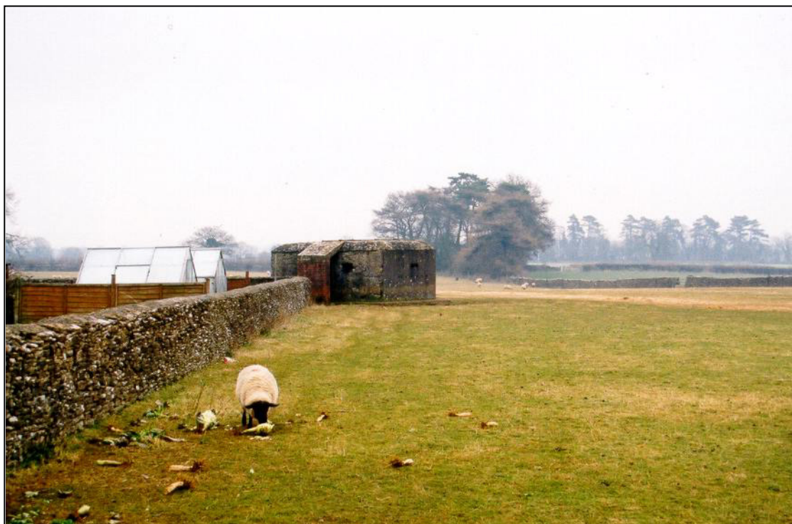
Fig. 6 - UORN 6850: type 24 pillbox at Star Cottages made of prefabricated concrete panels and with a roofed entry porch. It appears to be in excellent condition.