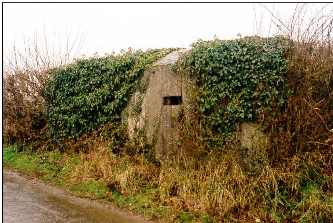
Fig. 7 - UORN 6851: this pillbox once commanded the crossing of the lane south of Star Farm by the anti-tank ditch. There was undoubtedly a roadblock near this position as well.

There is evidence of only one of what must have been several roadblocks within the defence area surviving today. Two concrete cylinders stand by the side of the lane seventy metres or so towards Avening from pillbox, UORN 6846. The other likely positions of roadblocks are just north of Star Cottages, at the junction with Roundabout Lane, and near pillbox, UORN 6851. There is no documentary confirmation of these sites, however, so they have not been included in the overall record or on Map 2.