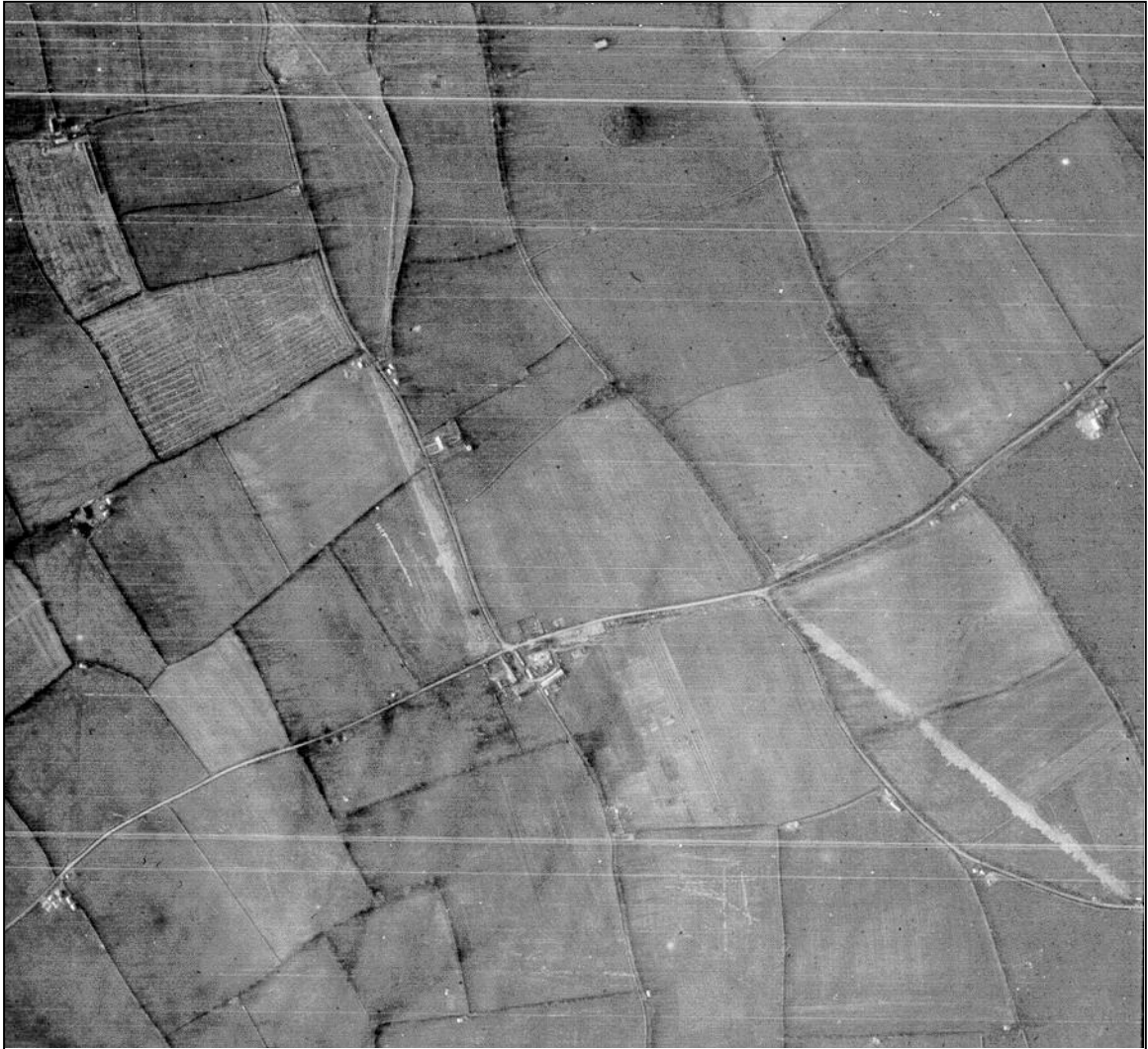
Fig. 1 - Air photograph taken in March 1946 showing the course of GHQ Line Green south of Avening. The line of the anti-tank ditch can be clearly seen. In the pasture field at the north (top) the ditch has been filled in creating a ridge that still survives today. Elsewhere, the line can be followed in the photograph as a soil mark. Star Farm is at the centre of the view towards the bottom.

islands providing all-round defence against enemy armour. Tetbury on the Line to the south was a 'centre of resistance', with a garrison in 1941 of 125 men of the 6th Bn. King's Own Yorkshire Light Infantry. 2 The artificial anti-tank ditch of GHQ Line Green was fortified with type 24 infantry pillboxes and with concrete blocks at points where it was cut by roads and trackways.