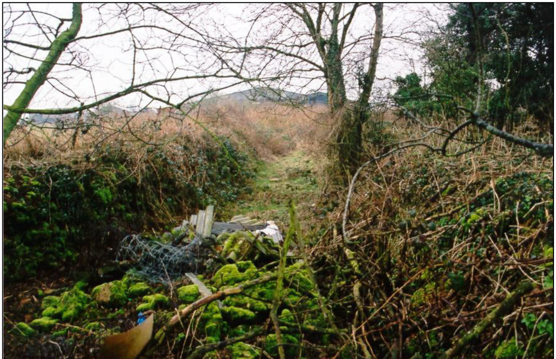
Fig. 3 - UORN 12508: length of unfilled anti-tank ditch east of Star Farm. It is being used as a dump for rubbish.

To the east of Star Farm, a length of some 100 metres of the anti-tank ditch survives unfilled within a strip of woodland. Such lengths of open anti-tank ditch are extremely rare [see Defence Area 32 - Hog Wood].