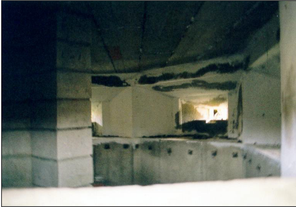
Fig. 8 - UORN 6851: interior of the pillbox - photograph taken through one of the embrasures. Concrete vertical panels bolted into place, and a breeze block anti-ricochet wall, can be seen.