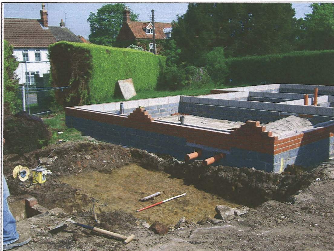
Plate 1: General view of the investigation trench looking north showing the underlying natural (scale is 1m).

No further deposits were recorded during the course of the investigations.