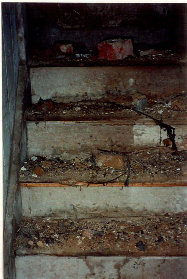
Photograph 5 – Existing Staircase.