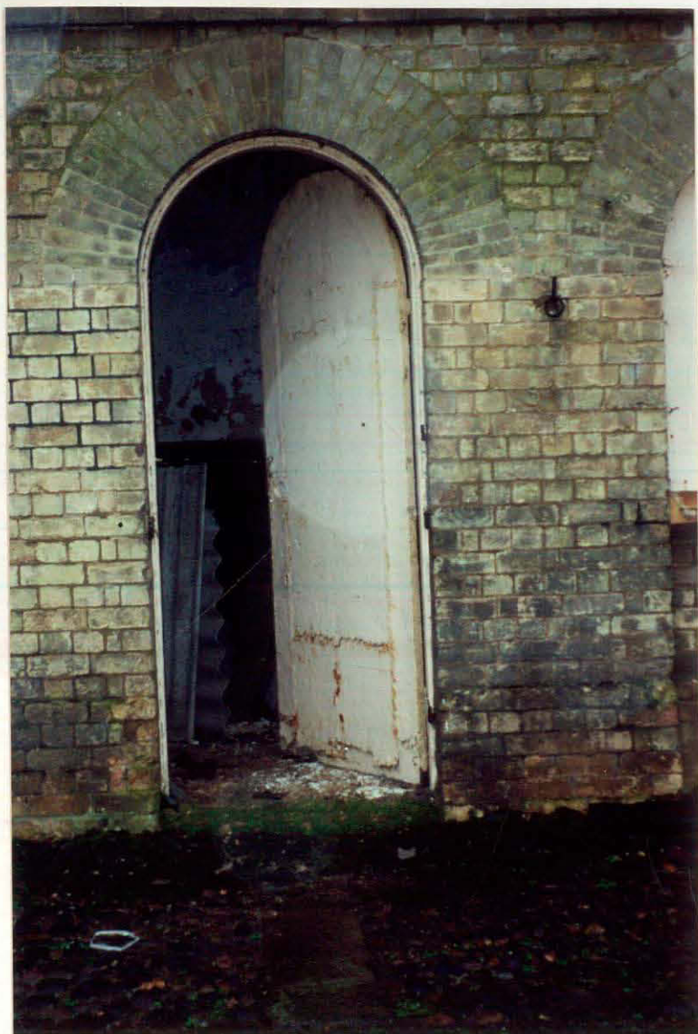
Photograph 1 – Typical door on left hand side range.