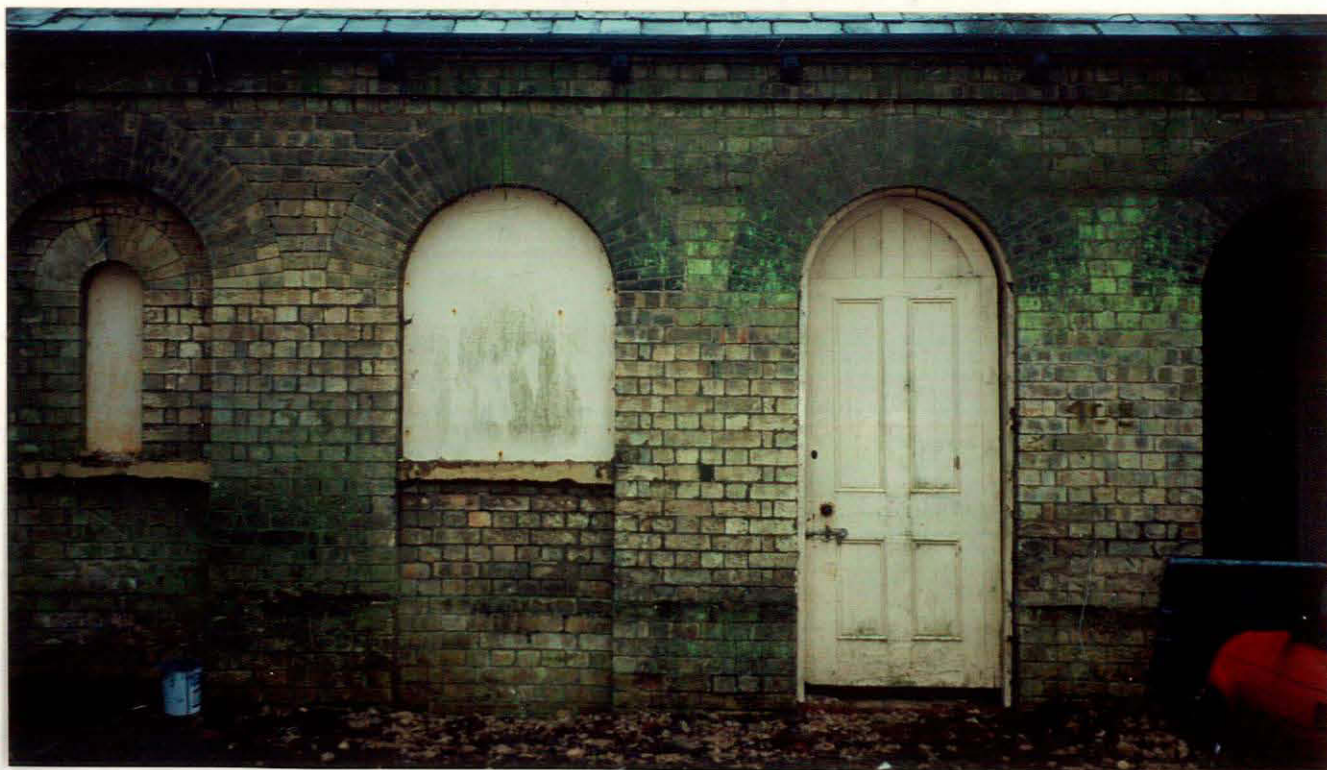
Photograph 2 – Typical door on right hand side range.