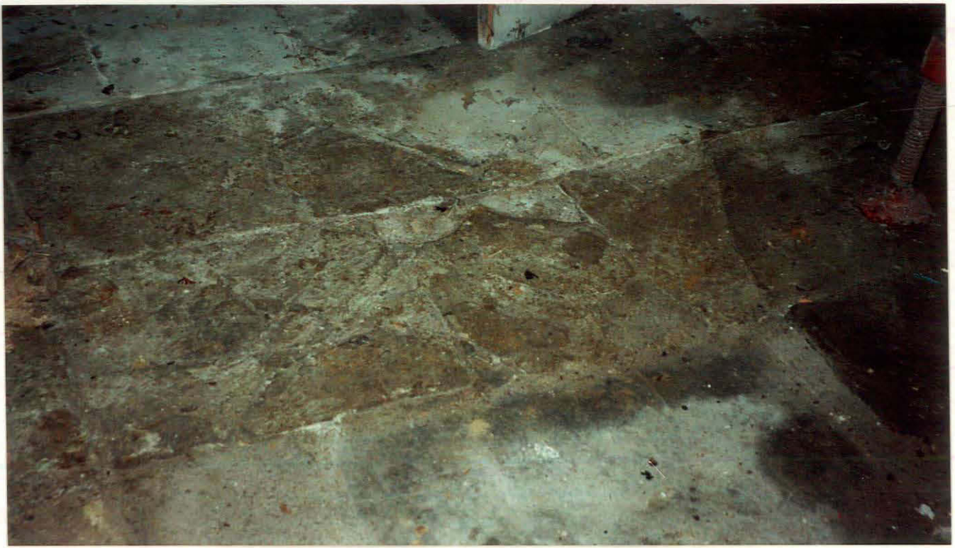
Photograph 3 – Typical Stone Floor.