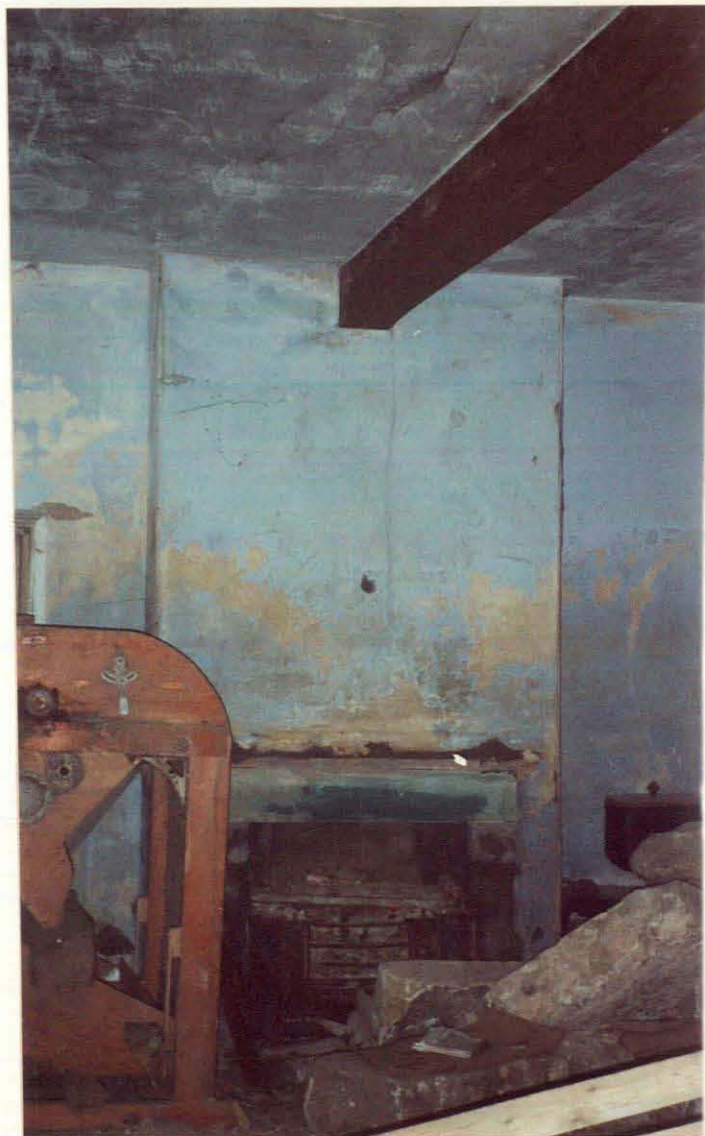
Photograph 4 – Fireplace, Chimney Breast and Beam above. (Main Barn)