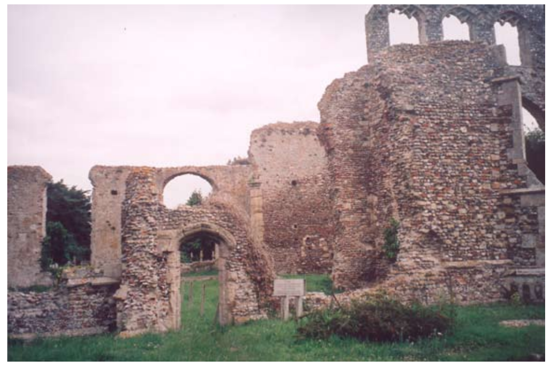
The decline of the ports is represented by the ruined church at Walberswick

Despite this disastrous decline in fortunes some of the ports survived, taking advantage of the more localised trade which remained. The ports of Southwold, Aldeburgh (Slaughden), Woodbridge, Ipswich, Felixstowe and Great Yarmouth particularly flourished, although trade continued elsewhere (Williamson 2005, 136). Coastal trade was important to the area, including exports such as cloth, malt, corn and bricks, and imports including coal and coke from the north east (Edwards 1991, 100; Williamson 2005, 137). Coasters ran south to London and north to Northumberland and beyond (Williamson 2006, 24). The long rivers meant that goods could be easily moved inland on smaller craft, principally keels and wherries (Williamson 2005, 137).