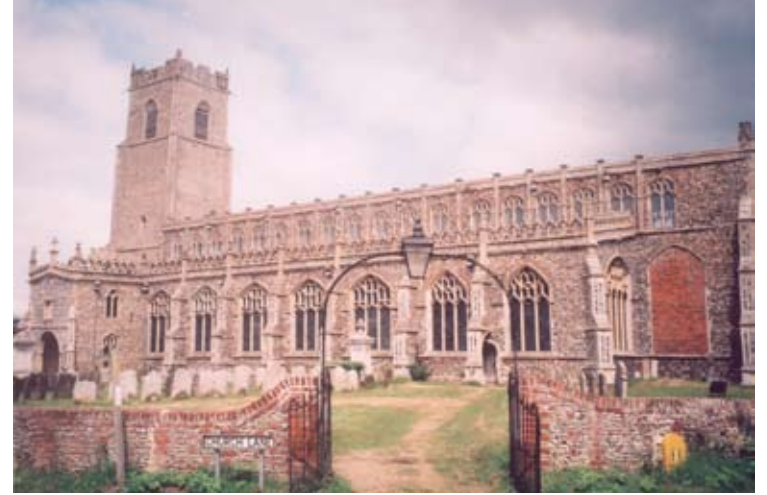
The church at Blythburgh, a legacy of the medieval port

The East Anglian coast was punctuated by numerous minor and major ports in the medieval period (Williamson 2006, 24) and these ports enjoyed a degree of eminence (Malster 1969, 3). The area was attractive as a result of its proximity to the continent, its long beaches and sheltered estuaries in contrast to the treacherous shoals around the Thames estuary. It was far cheaper in the medieval period to move cargoes by water than by road and the area also boasted abundant fish stocks (Williamson 2005).