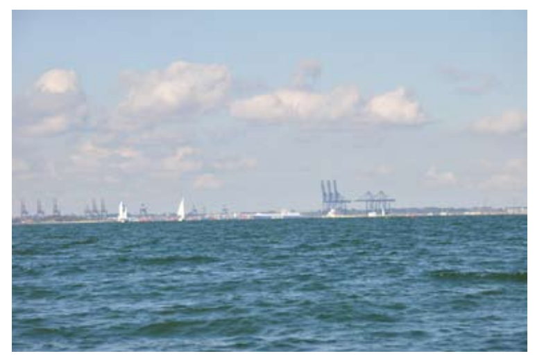
The port of Felixstowe from Walton Backwaters

Expansion of Felixstowe port began in 2008 with commencement of the Felixstowe South project. The scheme involves the conversion of the area previously used by P&O North Sea Ferries Limited, plus the largely redundant Dock Basin and Landguard Terminal, into a new deep-water container terminal (<u>www.portoffelixstowe.</u> <u>co.uk</u>). The first stage of the development began trial use in early 2011.