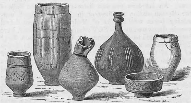
Pottery found in the New Forest.

One of the most curious discoveries during the past year was made in the New Forest, to the east of Fordingbridge. Over a tract of some extent were found scattered the fragments of Roman vessels, the greater part of which proved to be cast away from a potter's kiln. The Museum has secured about fifty of these vessels, of various sizes and shapes, of which a small group is represented in the accompanying woodcut. The greater part of the vessels consist of upright urns, with six indentations in the sides. Many of the pieces are remarkable for an iron-red glaze, due probably to overbaking, and they are all more or less cracked and warped. The excavations have been made by the Rev. J. Bartlett, under the superintendence of Mr. Akerman. The latter gentleman is preparing a paper on the subject, and I should not therefore wish to anticipate him in the particulars of a discovery principally due to his exertions.