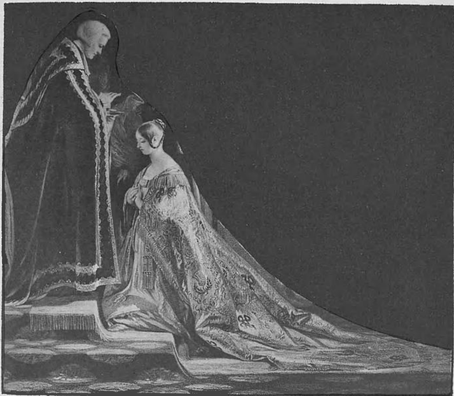
THE QUEEN, IN CORONATION ROBES, RECEIVING THE HOLY COMMUNION. FROM THE PICTURE AT WINDSOR BY SIR GEORGE HAYTER.