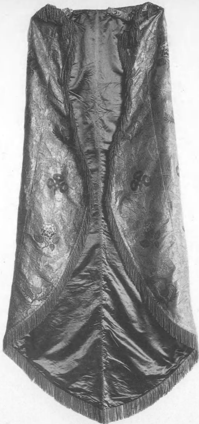
PALLIUM REGALE CUM AQUILIS. (Cope or Chasuble).