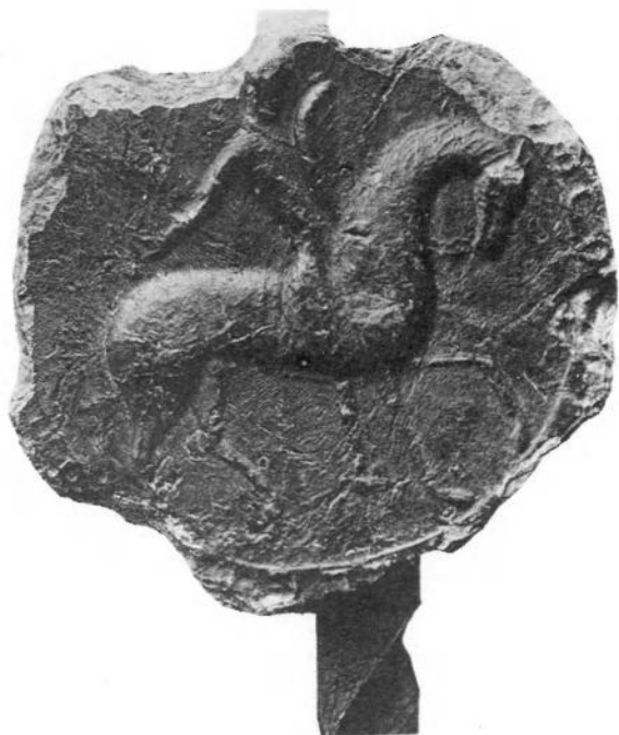
SEAL OF GILBERT DE CLARE, EARL OF HERTFORD. From Duchy of Lancaster Records Grants in boxes A.157.