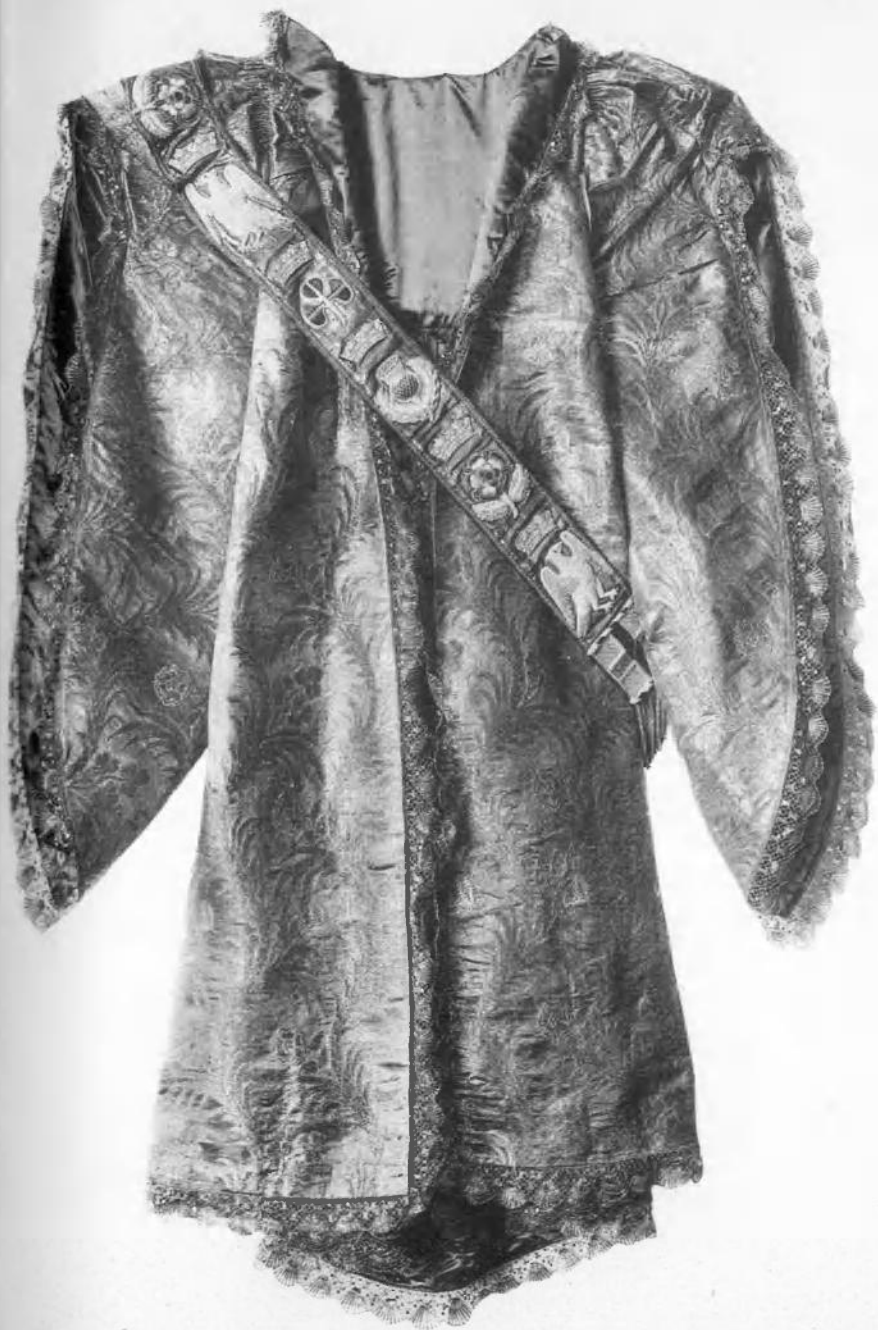
TUNICA AND ARMILLA. ( Tunicle and Stole ).