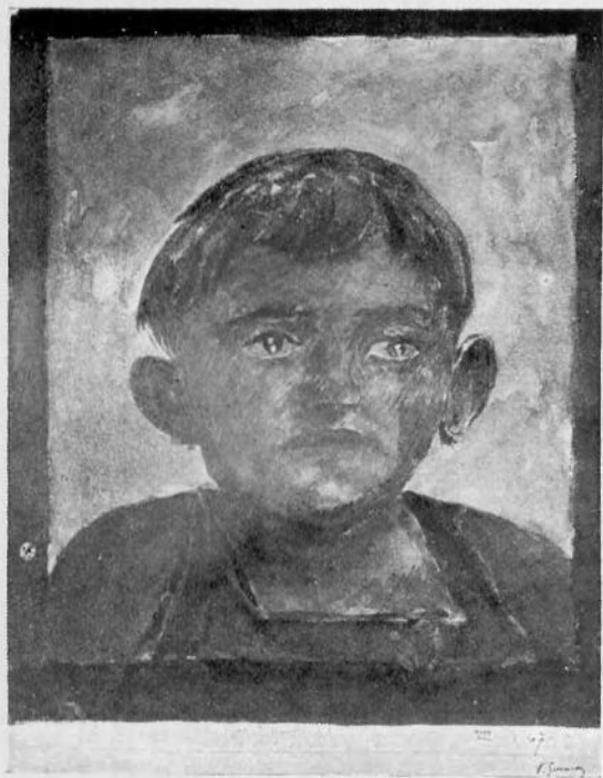
PORTRAIT FROM POMPEI. REGIO VII. INSULA I, HOUSE 47.