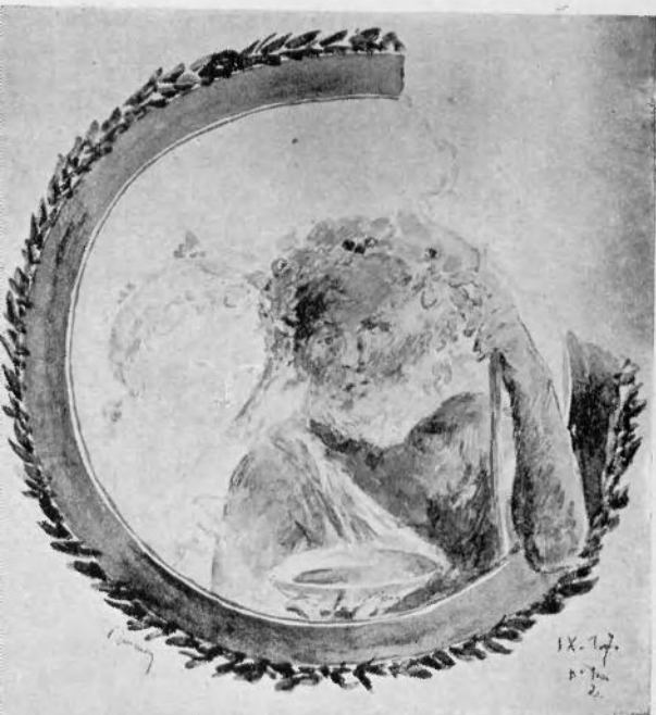
PORTRAITS FROM POMPEI. REGIO IX. INSULA I. HOUSE 7, No. 2.