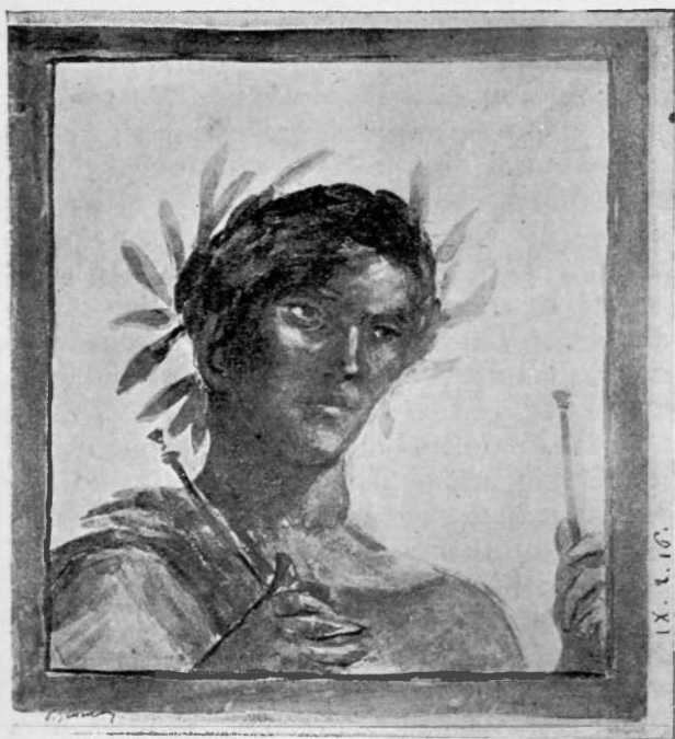
PORTRAIT FROM POMPEI. REGIO IX. INSULA II. HOUSE 16.

event, though they possess several symbolic adjuncts, such as the ivy and the thyrsus. Nothing more likely, then, can be their history than that they were portraits of a family who wished to see their likenesses reproduced as Bacchic characters. We reproduce the woman and her representative of a child, too out of proportion for modern requirements; and we also show the so-called "Paris," which is a woman, as can be seen by the pearl earrings, the hair hanging down the back, and the cupid looking