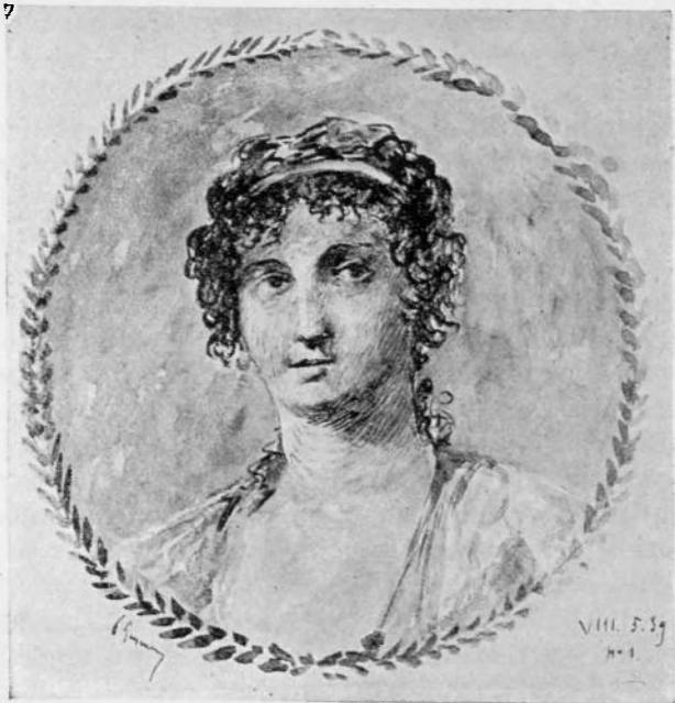
PORTRAIT FROM POMPEI. REGIO VIII. INSULA V. HOUSE 39. No. I.

chiaroscuro of maroon colouring. The head and shoulders of a woman, nude, her breasts just visible, and her right arm raised in a graceful curve, the hand holding some object above her head; the arm seems to partly enfold the head of a man behind her right shoulder. And as if in contrast to her fair face and breasts, he is painted very dark, like an Italian whose ancestors, as well as himself, have been much exposed to the sun's rays; his eyes speak ardently; his lips are opened as their cheeks touch. The picture is full of the passionate life of the south.