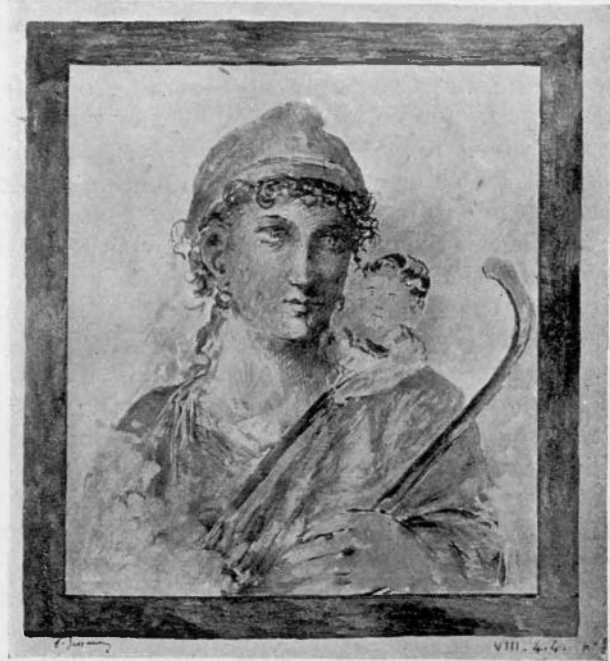
PORTRAITS FROM POMPEI. REGIO VIII. INSULA IV. HOUSE 4. No. 1.

crook, seems to preside over this voluptuous scene, and to listen to a little cupid seated on his shoulder." All this is so thoroughly and innocently English, even out-doing the simple classic names that Fiorelli gave to these little pictures, which consist merely of the head and shoulders of people that, according to Dyer, "are moving in the mazes of the dance," that its style is really worthy of being adapted to some modern subject as a parody. The characters represented are all that they say (except