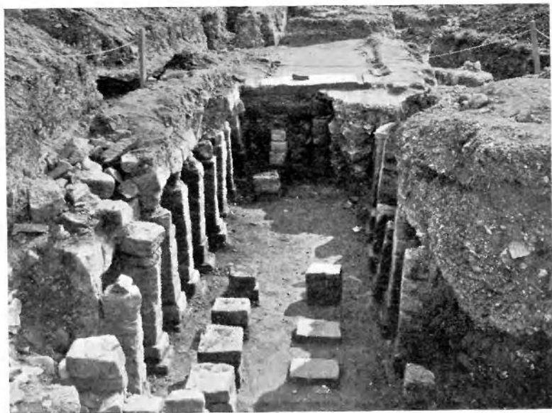
FIG. 1.—REMAINS OF PILLARED HYPOCAUST.