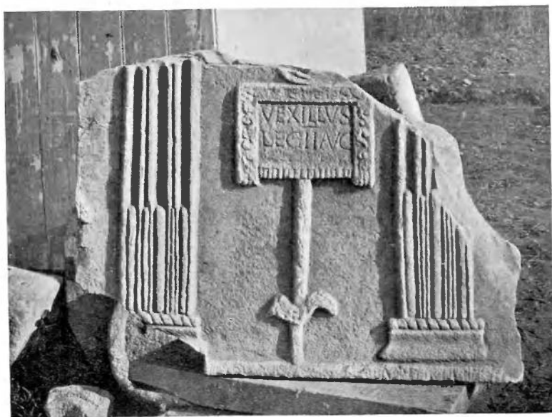
FIG. 2.—SLAB WITH REPRESENTATION OF A LEGIONARY STANDARD.