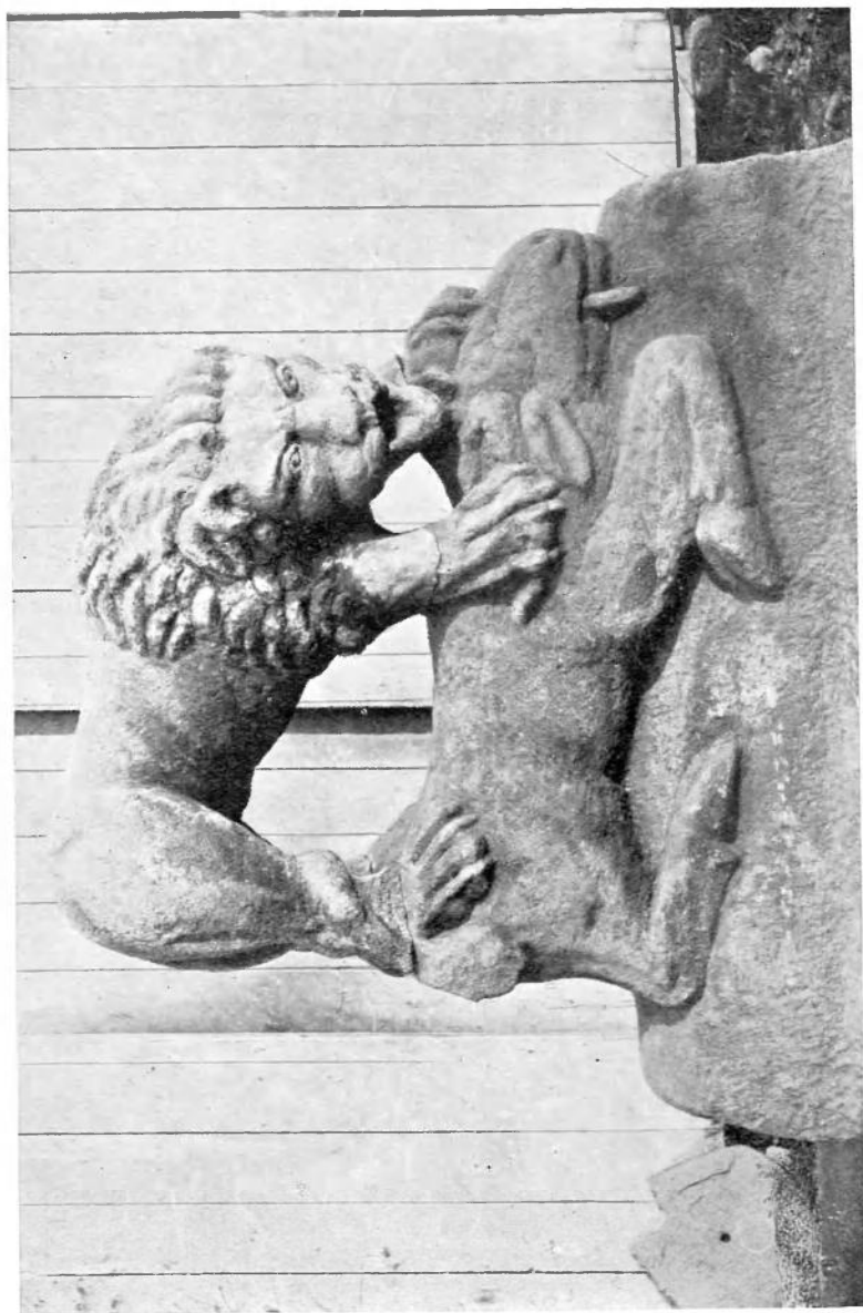
SCULPTURED GROUP OF LION AND STAG.