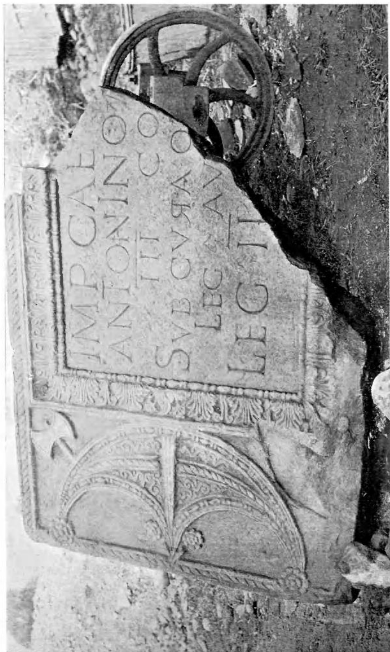
SLAB WITH INSCRIPTION TO ANTONINUS PIUS.