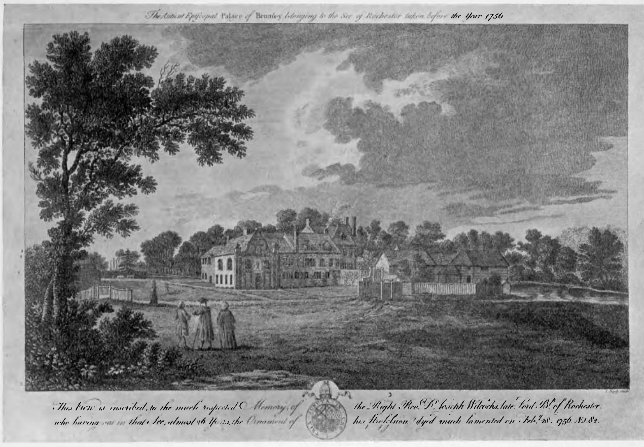
VIEW OF BROMLEY PALACE BEFORE 1756.