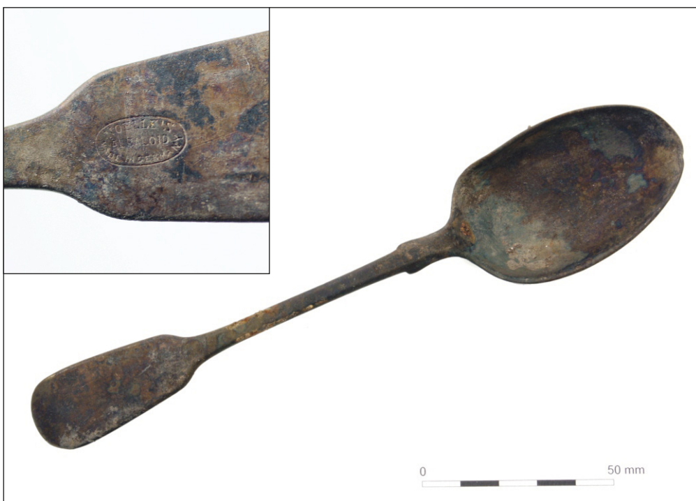
Plate 2: Fiddle pattern dessert spoon, copper alloy with iron-core to handle, and detail of maker's mark on underside of handle, Trench 53

This material is for client report only © Wessex Archaeology. No unauthorised reproduction.