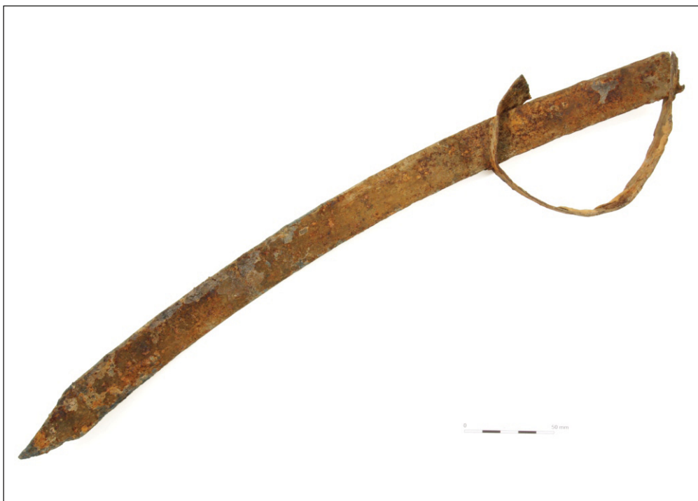
Plate 5: Iron toy sword. Trench 59, <1012>, context 1000