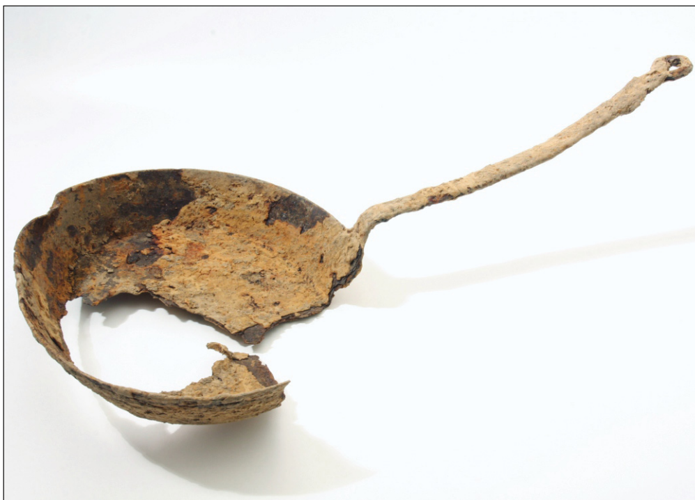
Plate 1: Oval shaped iron frying pan with rectangular-sectioned handle. Trench 59