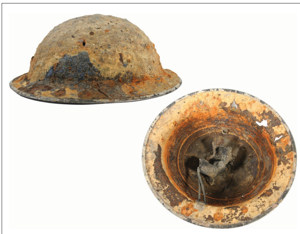
Plate 9: World War II steel helmet. OL-1907