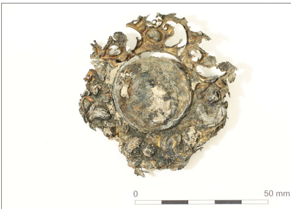
Plate 6: Victorian coffin fitting, gilded lead. Trench 59, <1000>, fill of revetted channel 1003

This material is for client report only © Wessex Archaeology. No unauthorised reproduction.