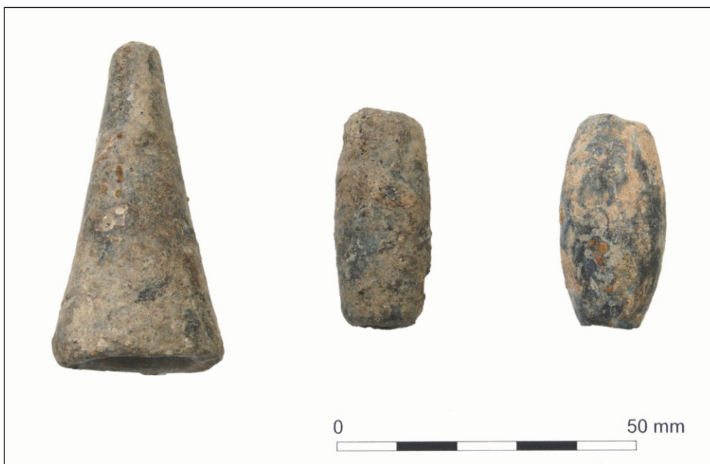
Plate 8: Lead fishing weights. Trench 75 (Temple Mills); (from left): <47, context 376; <41>, barrel 182; <36>, unstratified