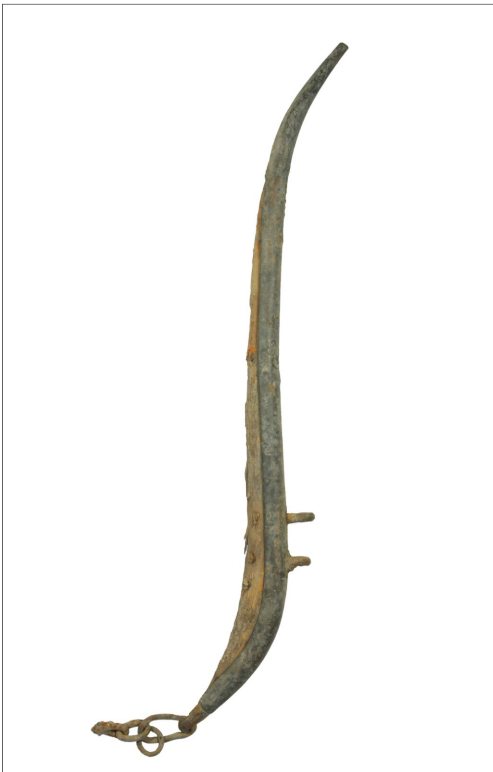
Plate 7: Wooden hame from horse harness. Trench 75 (Temple Mills), <1000>, unstratified