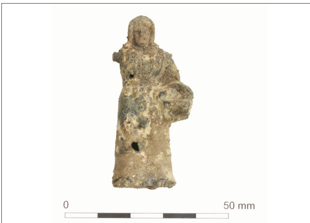
Plate 4: Lead figure of a farmer's wife, part of a farm set, dating to the 1930s. Trench 75 (Temple Mills), <1>, unstratified

This material is for client report only © Wessex Archaeology. No unauthorised reproduction.