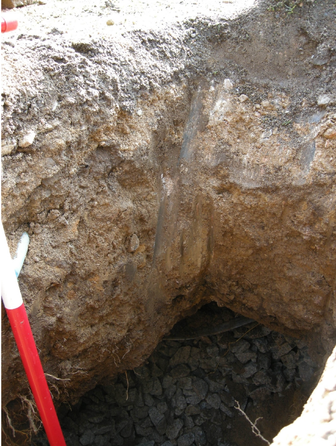
Illus 3 Soakaway in TP1

A water pipe was ruptured at the SW corner of the test pit. No archaeological features or artefacts were observed.