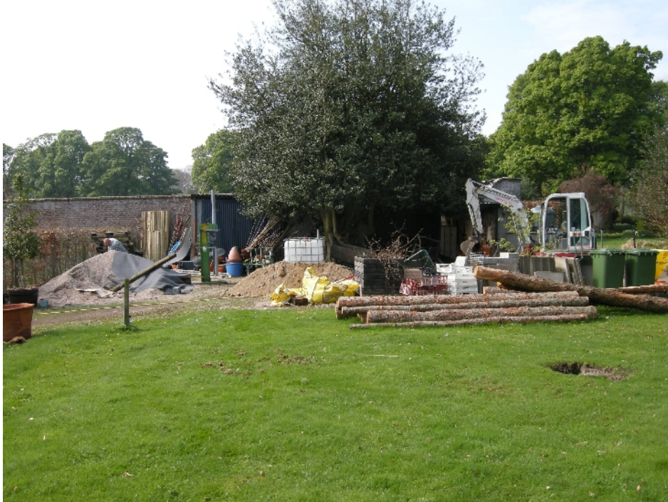
Illus 1 Location of test pits looking W