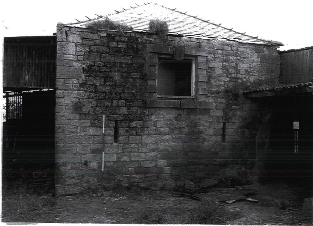
Plate 7: North elevation of barn (Building 8), looking south (photo 4/17)