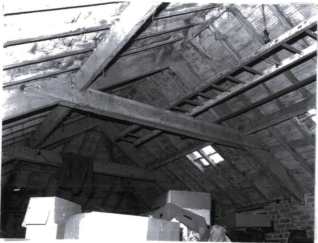
Plate 14: Typical roof truss in Building 11, looking east (photo 3/17)