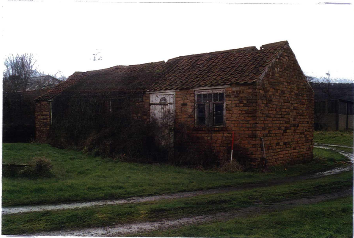
Plate 4: Farm building (Building 5), looking north-west