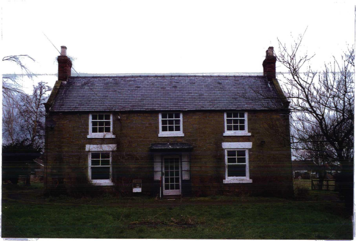
Plate 5: Farmhouse (Building 7), looking north