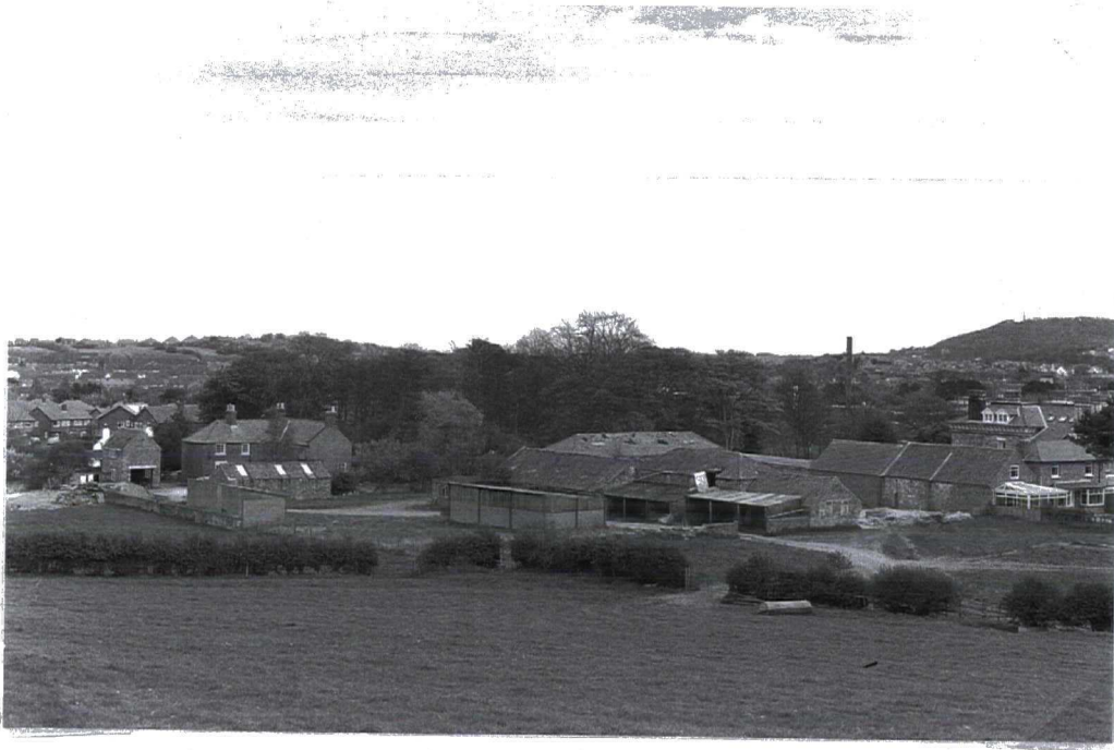
Plate 1: High Farm complex from the north-west (photo 6/10)