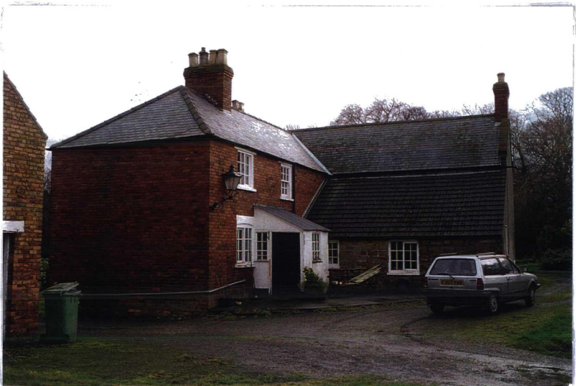
Plate 6: Farmhouse (Building 7), looking south-east