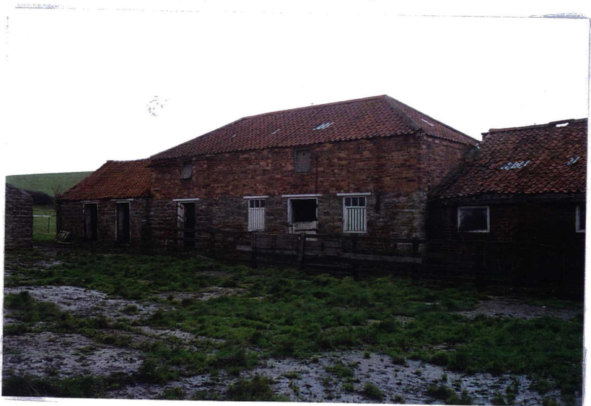
Plate 12: South elevations of Buildings 11 & 12, looking north-west