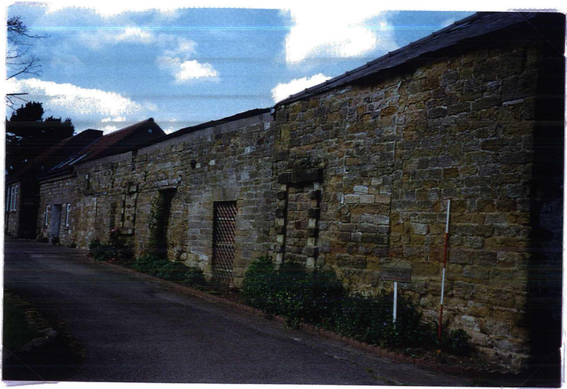
Plate 11: South elevations of barn and stables (Buildings 8 & 9), looking north-west