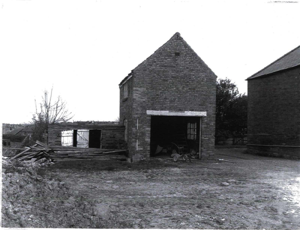
Plate 2: Garage and coal houses (Building 2), looking east (photo 6/9)