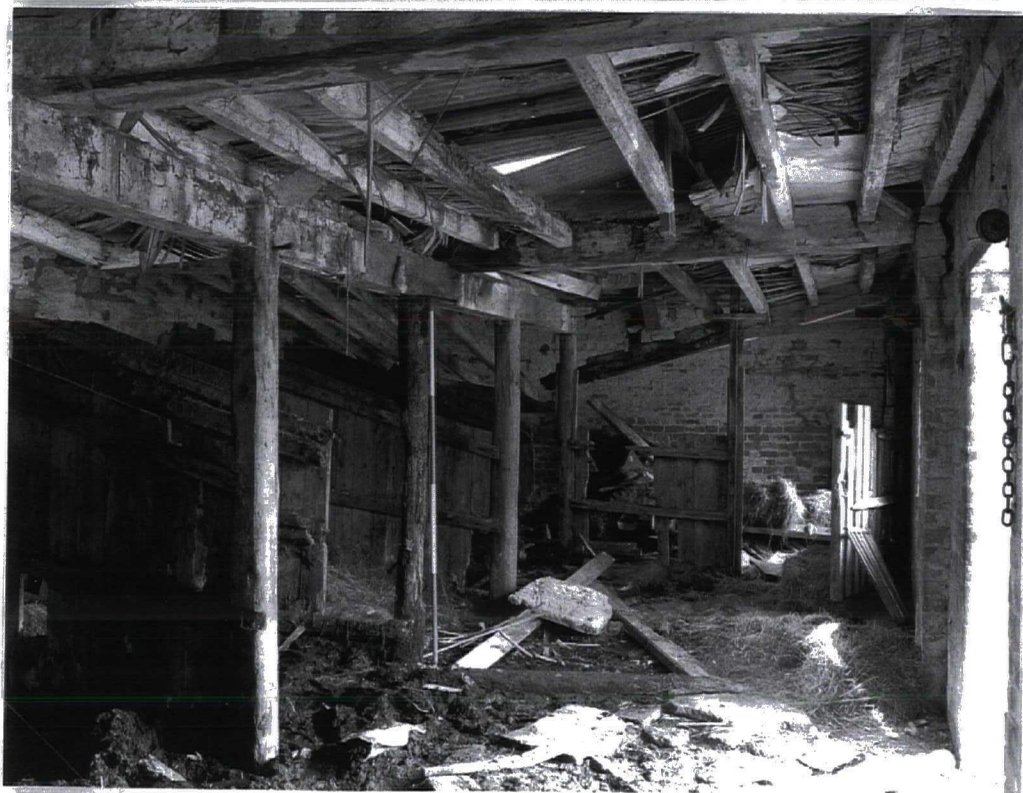
Plate 10: Interior of stables (Building 9), looking west (photo 5/12)