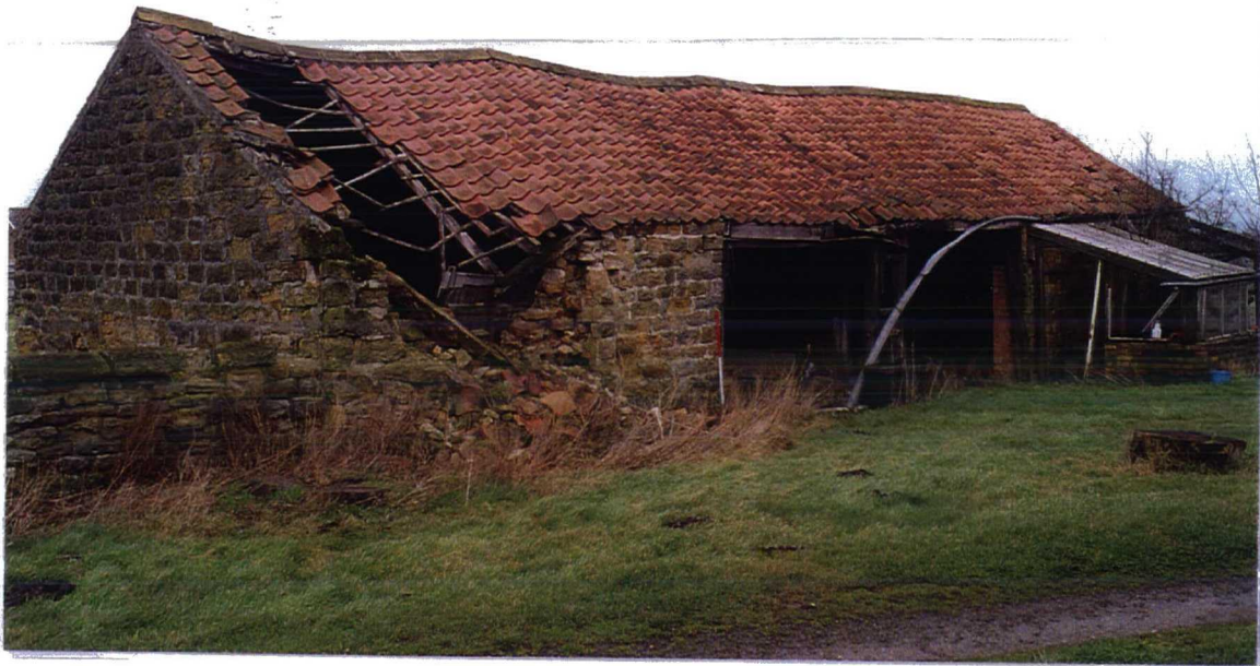
Plate 3: Farm building (Building 1), looking north-east