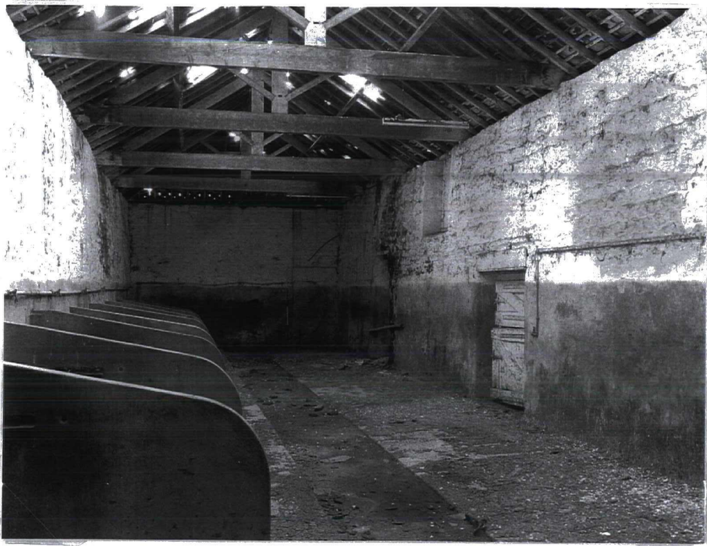
Plate 9: Interior of barn (Building 8), looking south (photo 5/7)