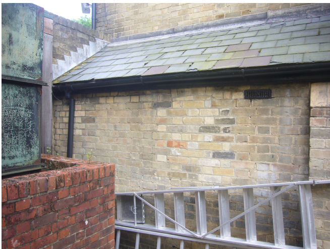
Top: North elevation of Main House Bottom: North elevation of former Cloakroom (now Office 14 - see Main House Photographic Record) showing two bricked-up windows