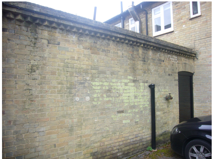
South Elevation of 'mews block' and Yard Wall Top - South Elevation of 'mews block' of 'north wing' - ground floor window pre-1950; first floor windows inserted c.1950 Bottom - Yard Wall - differing positions shown on historic OS sheets