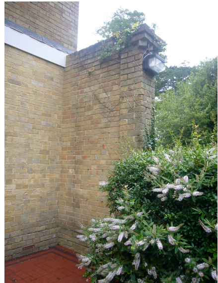
Details of bay to South Elevation ( 'main block' ) and former Balcony support wall