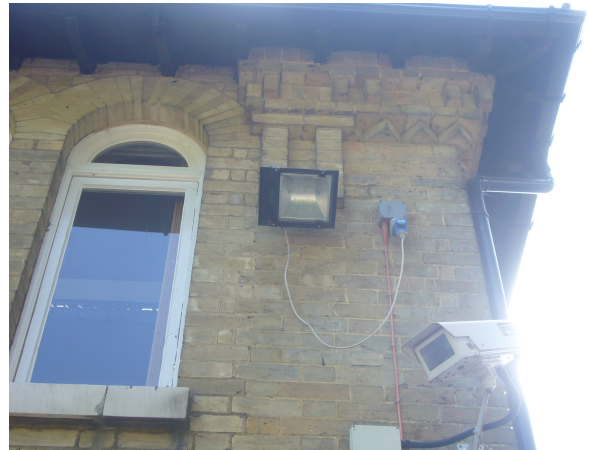
East Elevation - Entrance Elevation - First Floor - Details Continued from sequence on previous page