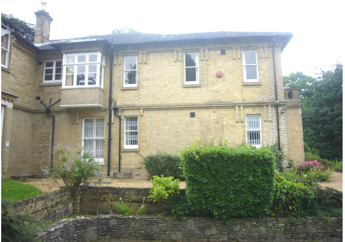
West Elevation of 'main block' of House (details to follow)