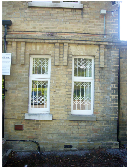
East Elevation - Entrance Front - Details Ground Floor

Top left - window to small Kitchen - formerly Porch (note stone entrance step at bottom course from vent pipe to gully) Top right - 1950's entrance door and screen- replacing former window to Hall Bottom - two windows at north end - left window pre-1950, right window post-1950