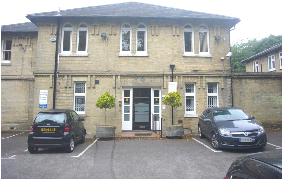
East Elevation of Entrance Front (details to follow)