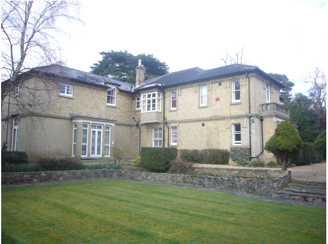
West Elevation of 'main block 'and South Elevation of 'west wing" from south-west