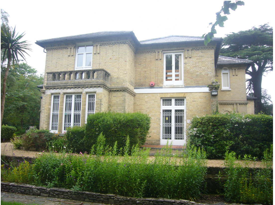
South elevation of 'main block' of house South-east Balcony structure missing - removed post-1966?