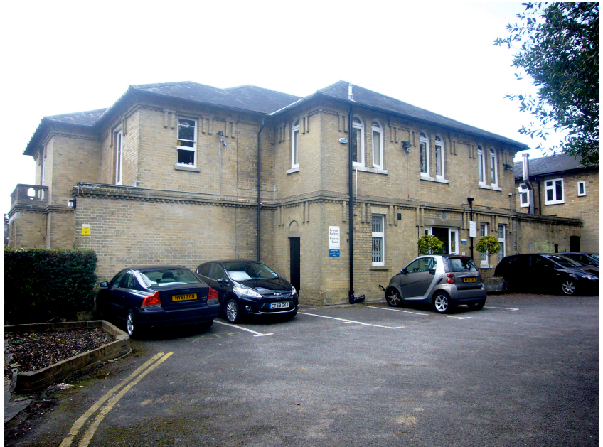
East Elevation of House Top - from north-east Bottom - from south-east