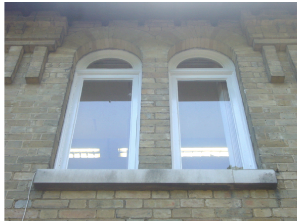
East Elevation - Entrance Front - First Floor - Details Northwards sequence from top left to bottom right Continued next page