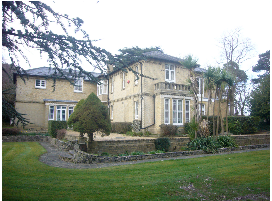
General views - from south-east (top) and south-west (bottom)