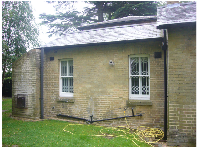
West Elevation of 'north wing' Constructed after (c. 1865) 'west wing' - probably later C19

Top - south section Bottom north section with added former WC accommodation at north end