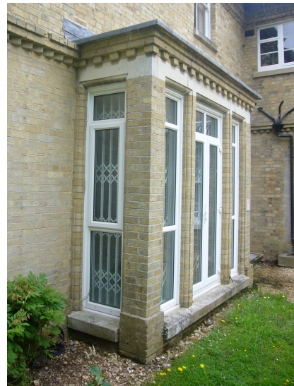
Detail of bay to South Elevation of 'west wing' (Note absence of dog-tooth detailing)