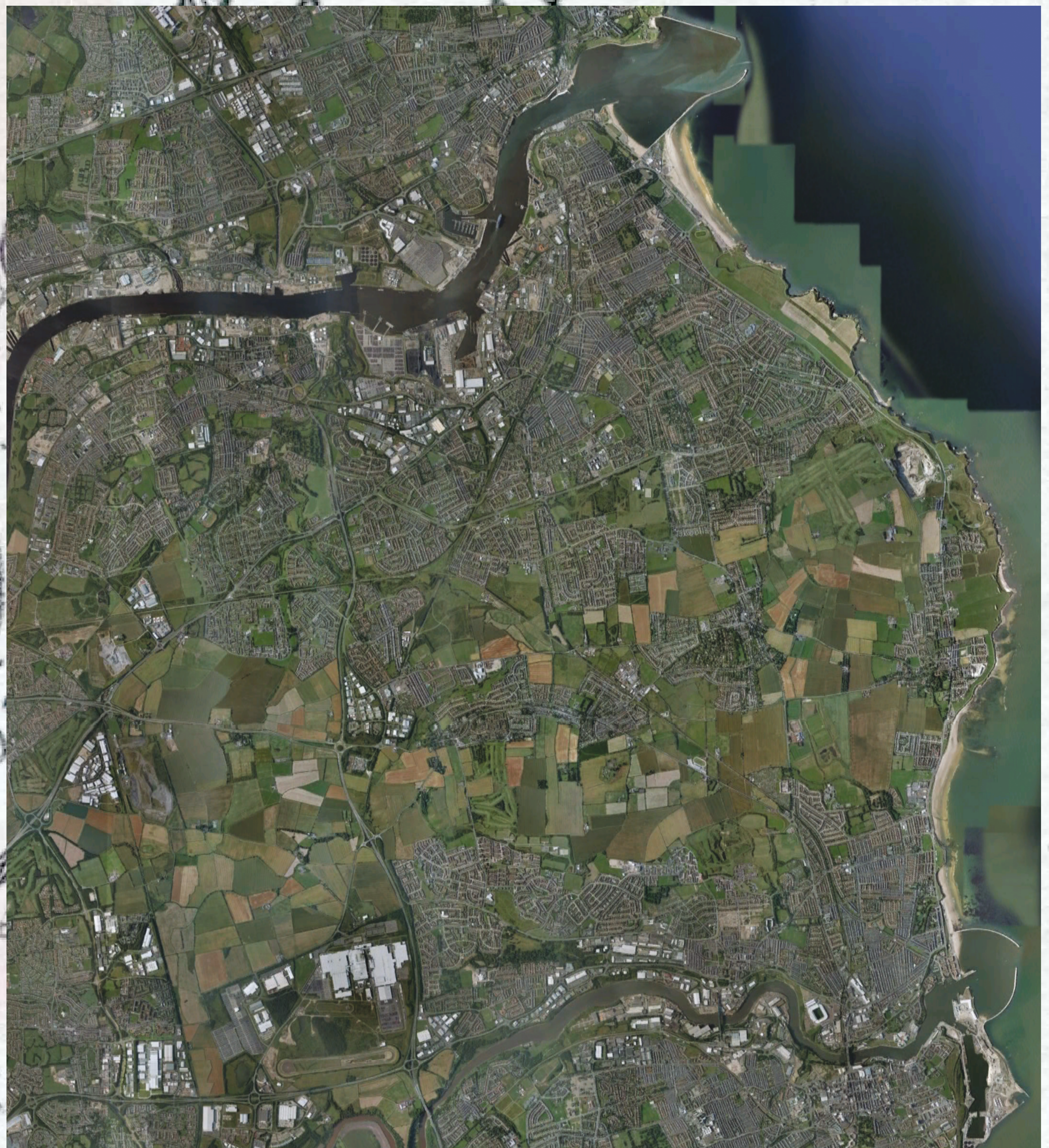
aerial view of the land between the rivers Tyne and Wear