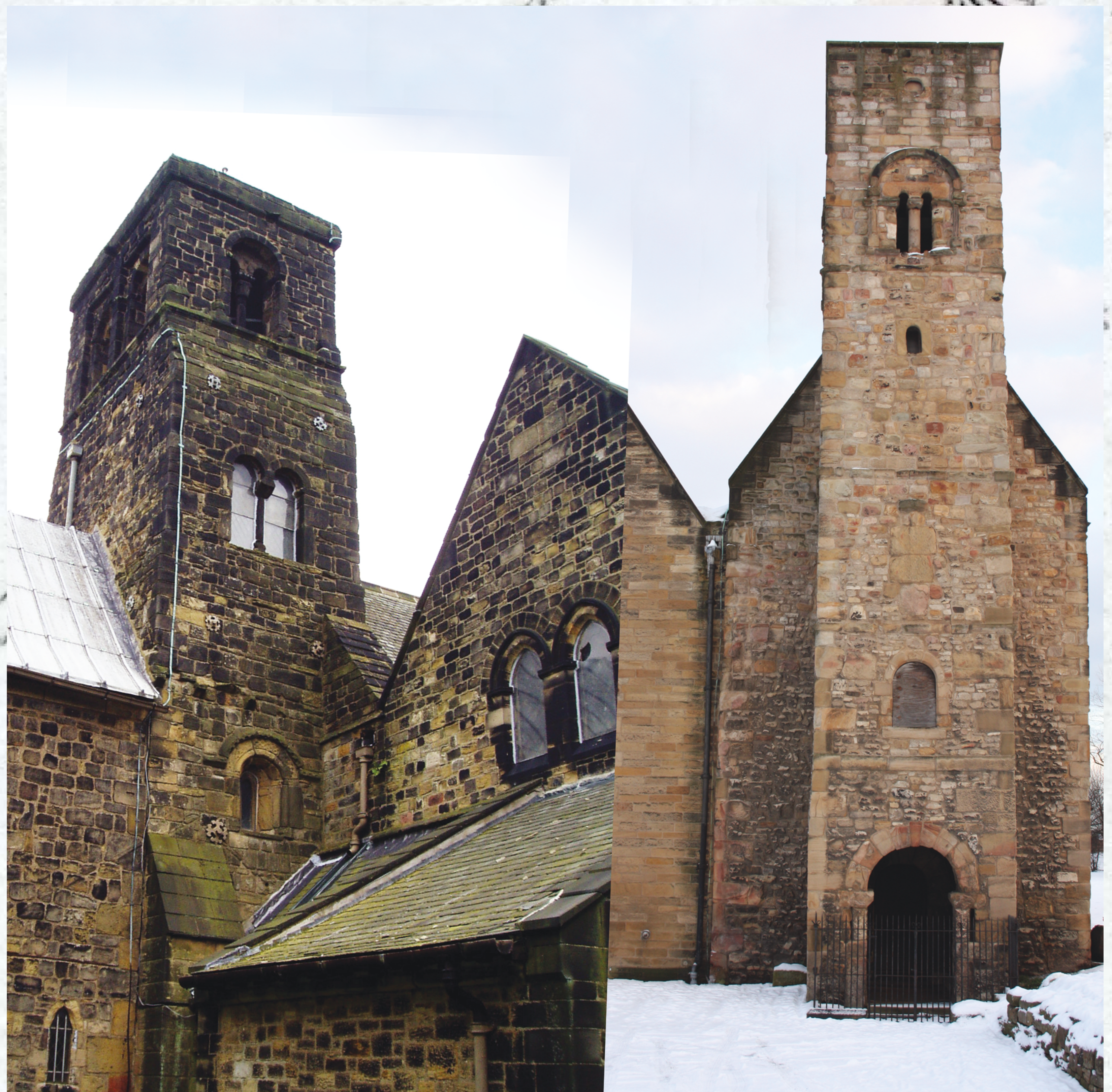
St Paul's, Jarrow and St Peter's, Monkwearmouth

In 2009 Newcastle and Durham Universities initiated a project aimed at exploring the landscape setting of the early Christian monastic sites of Monkwearmouth and Jarrow, from their foundation some seven centuries after the birth of Christ, to their place in today's contemporary society. Bringing together a large team of professionals with funding from English Heritage, this project has established new evidence for the form, layout and location of these early monasteries and the extent and preservation of associated archaeology, surviving above and below ground. The project has also revealed insights into the impact of these foundations in the local region, exploring their enduring meaning and value to the past and contemporary communities inhabiting the land between the rivers Tyne and Wear.