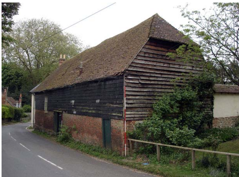
Plate 1: the Tythe Barn, view from the northwest