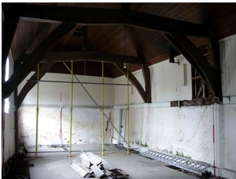
Plate 10: interior of former village hall, viewed from the southeast