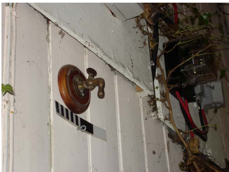
Plate 13: gas tap on internal south wall of former village hall