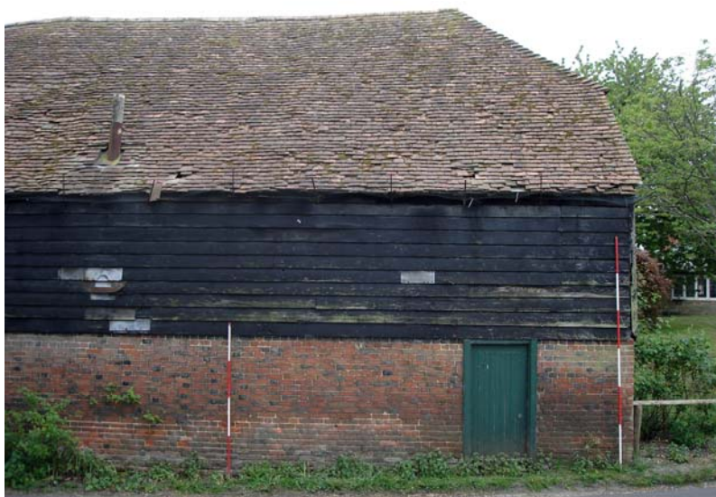
Plate 3: the west end of the north wall