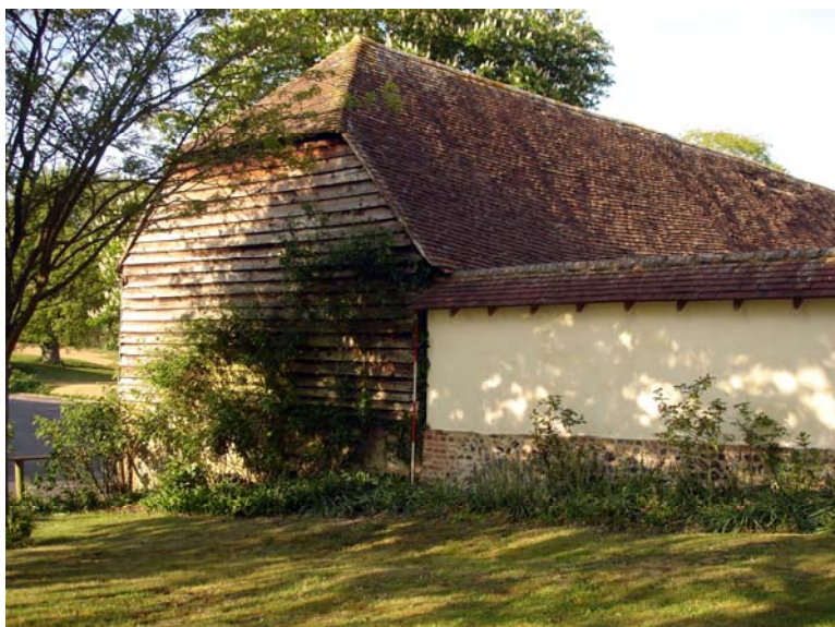
Plate 2: view from the southwest