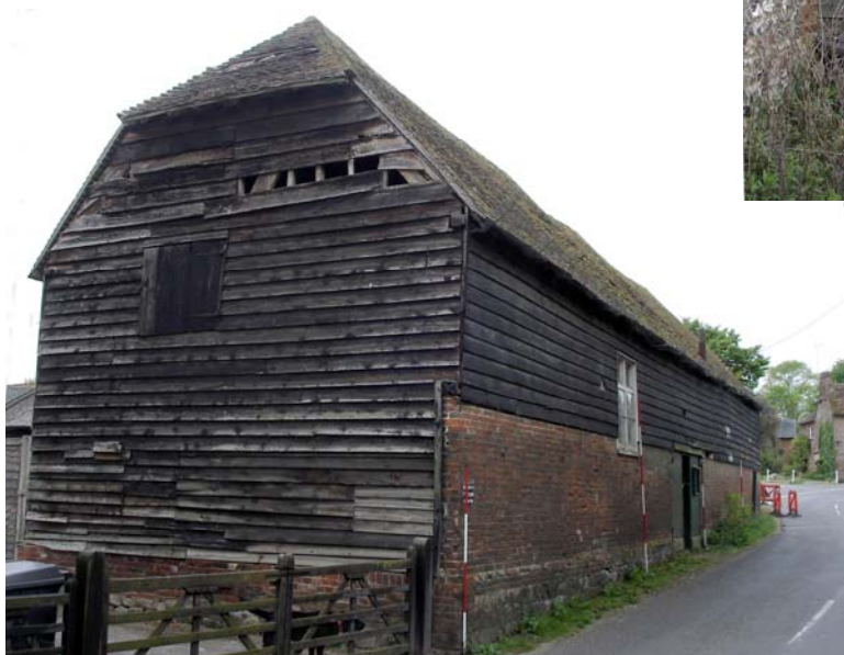
Plate 6: the Tythe Barn from the northeast