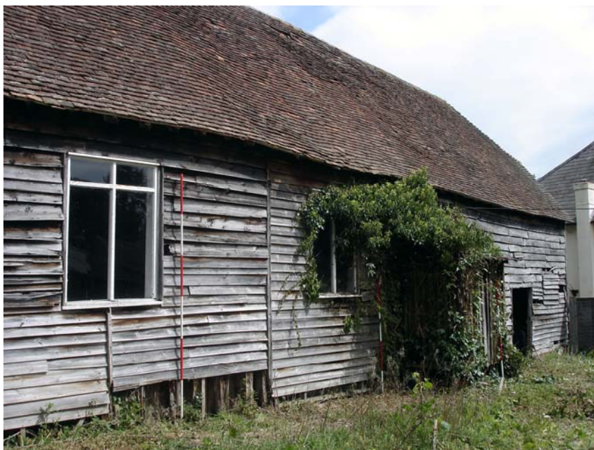
Plate 7: the south wall, viewed from the southwest