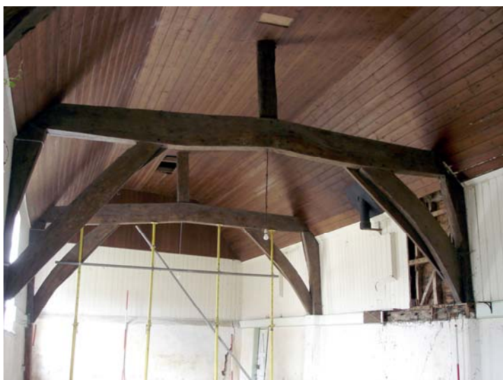
Plate 9: internal roof structure and panelled ceiling of the former village hall, viewed from the southeast