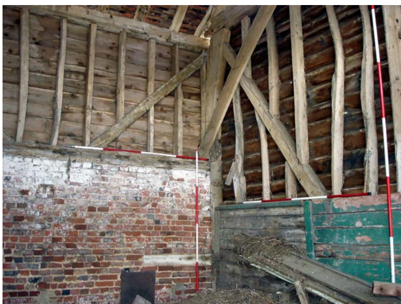
Plate 15: interior of the 'Bull Pen', northwest corner