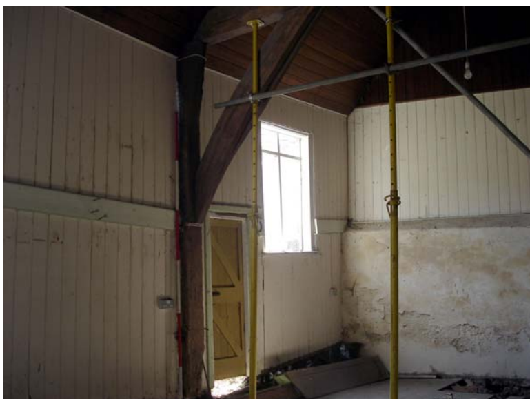
Plate 12: northwest corner of former village hall