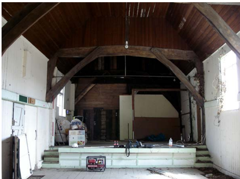
Plate 11: interior of former village hall, viewed from the west