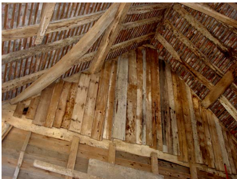
Plate 17: interior of the 'Bull Pen', west wall, upper section and roof structure