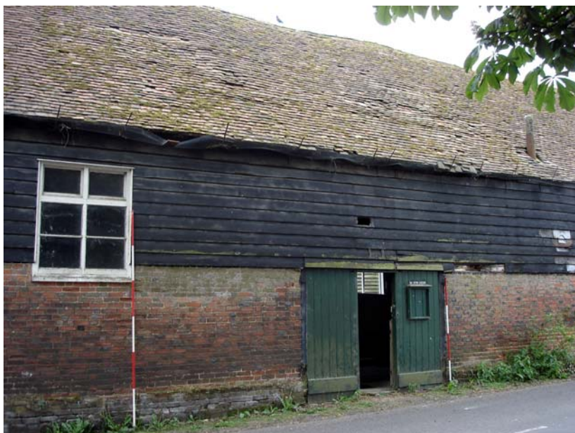
Plate 4: the main entrance, from the northeast