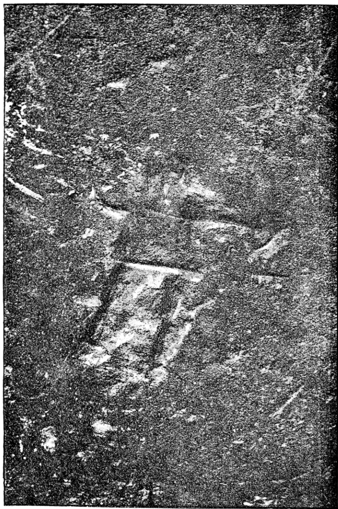
FROM ROMAN CEMETERY, CARLISLE.