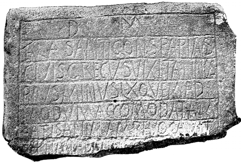
SEPULCHRAL SLAB FROM CARLISLE.