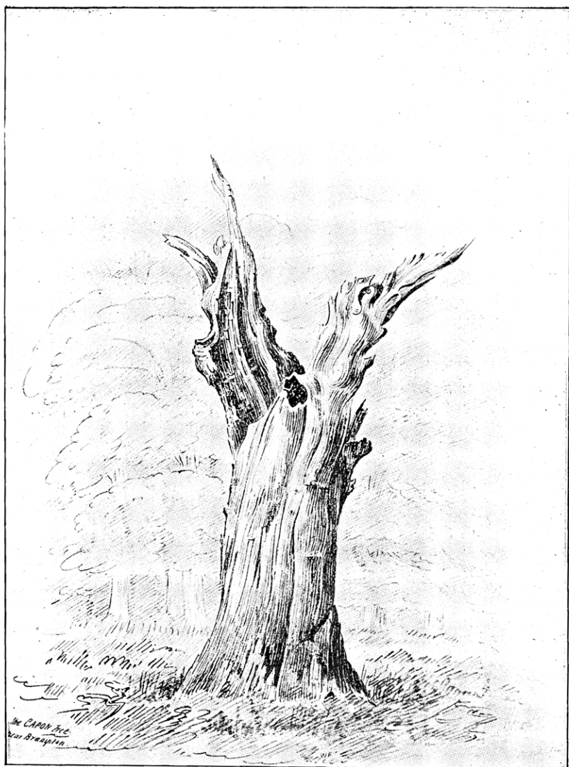
THE CAPON TREE AS IT WAS IN 1833.