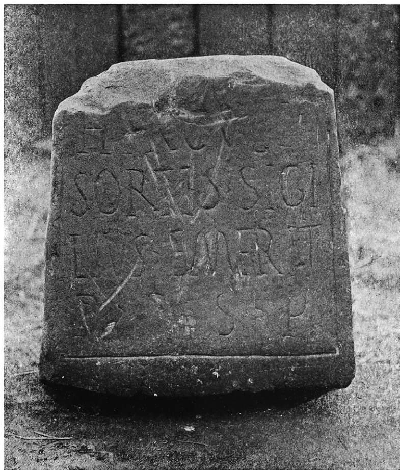
PLATE B.—ROMAN SLAB FROM OLD CARLISLE.