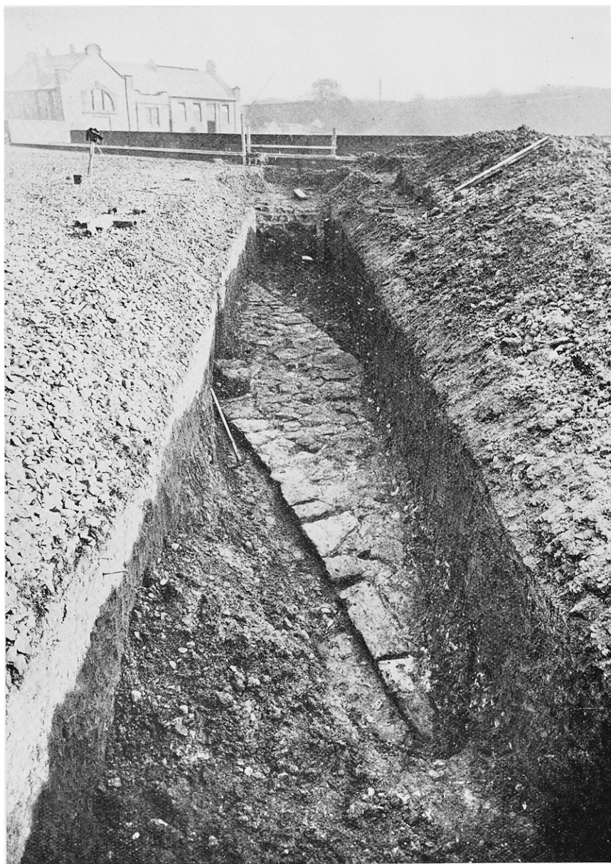
FIG. 3.—THE WALL AT THE SEWAGE DISPOSAL WORKS, CARLISLE, Looking east.