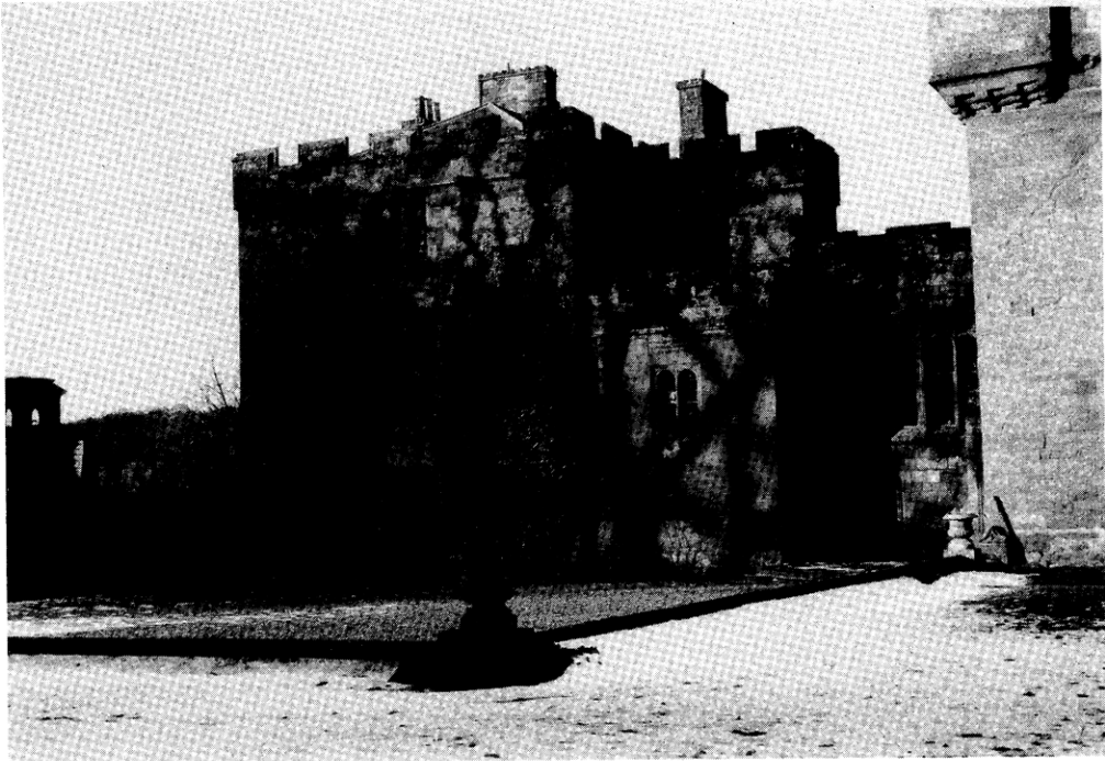
PLATE I. — Newbiggin Hall from the same view, showing the West tower rebuilt by Anthony Salvin.