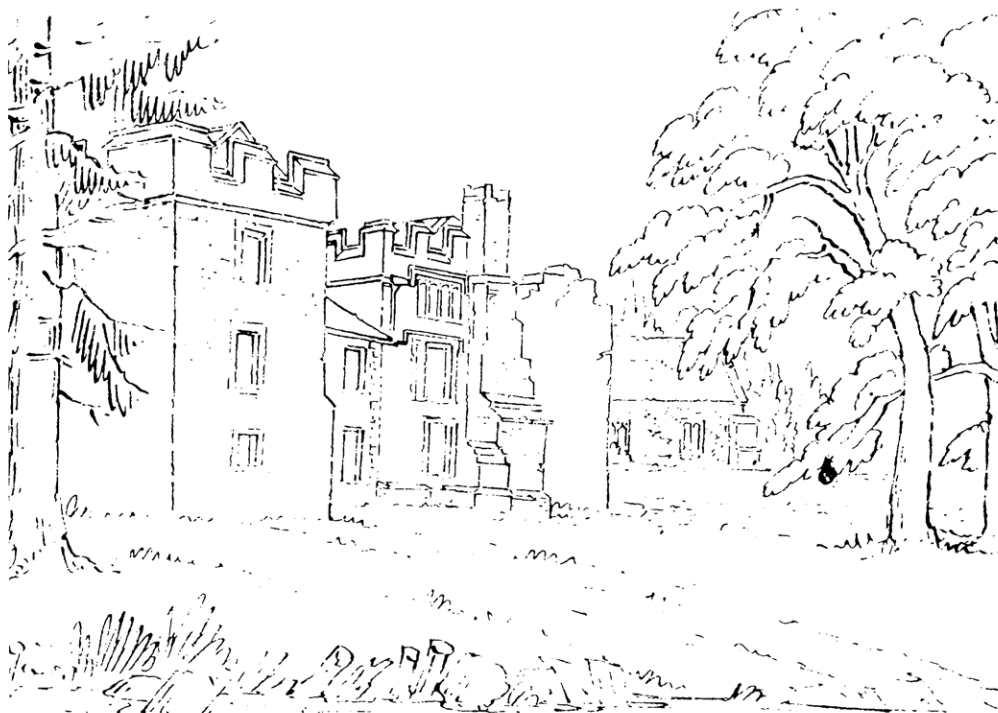
FIG. 2. – Part of Newbiggin Hall taken down 15 May 1844.