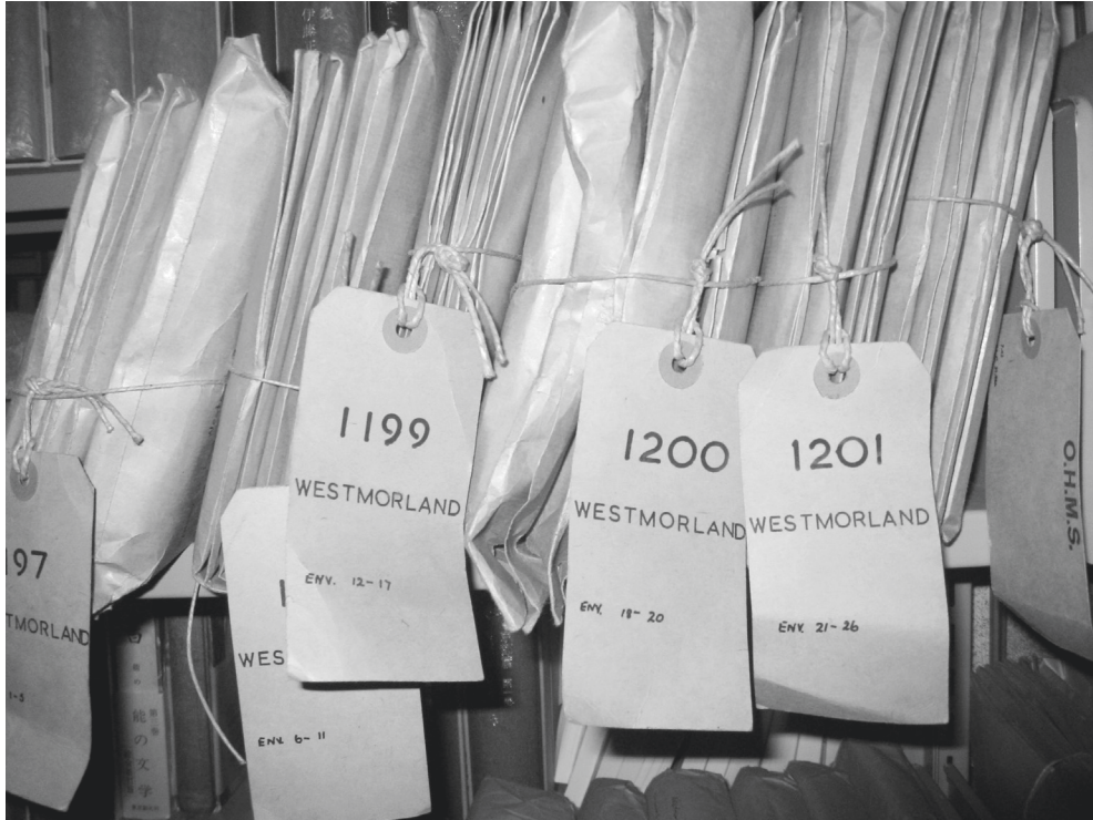
FIG. 3. VCH Westmorland slips at Egham in 2010.