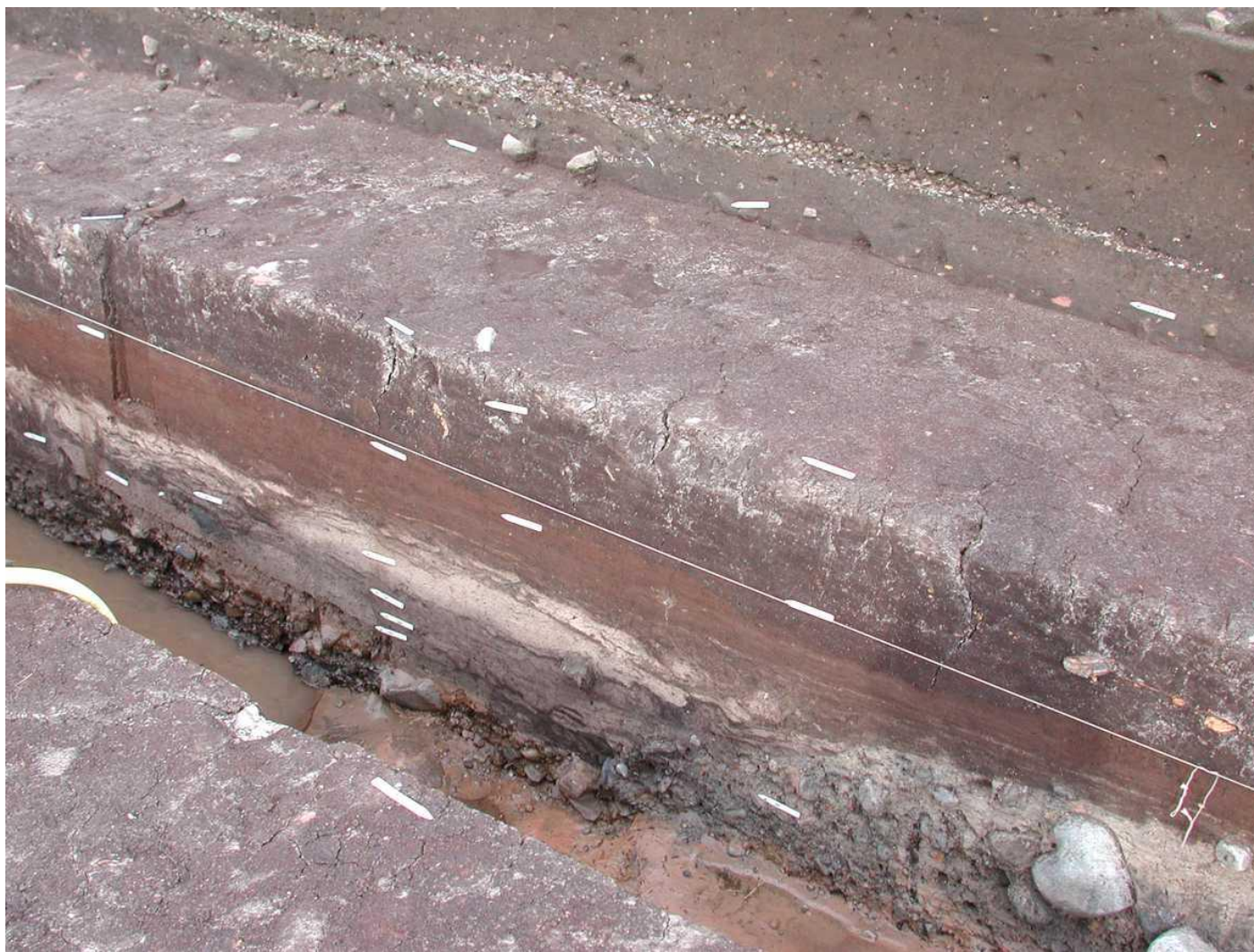
Figure 2. Section through 'pond' sediment, courtesy of Martin Carver.