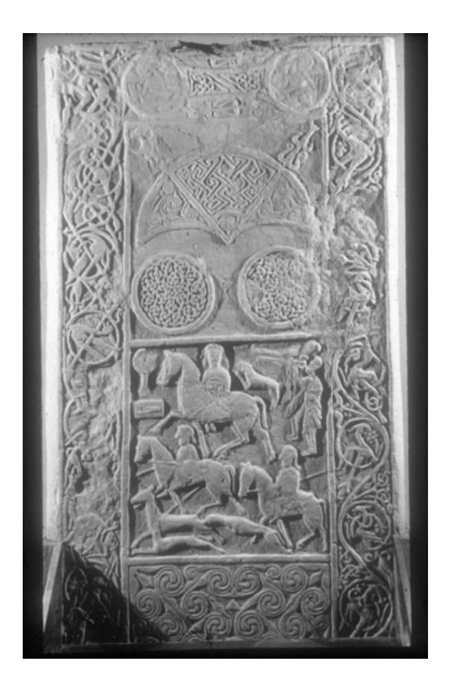
PLATE II: The reverse side of the Hilton of Cadboll stone in the National Museum. The other side was defaced but had originally carried a cross.