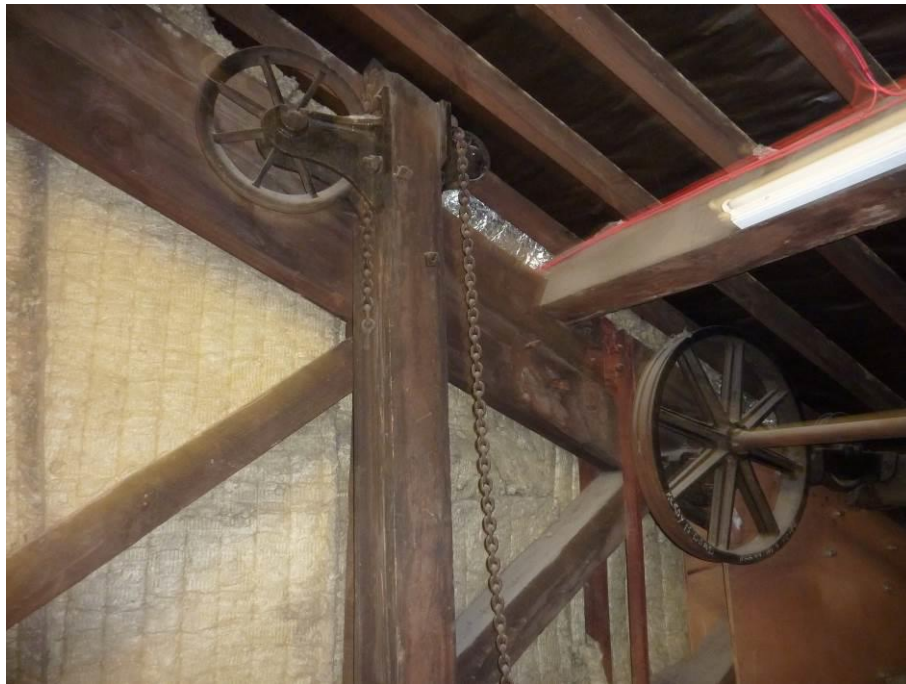
Figure 3. Part of the mechanism for raising the screen between the meeting rooms

larger meeting rooms to be divided by means of a partition which could be moved by raising vertically.