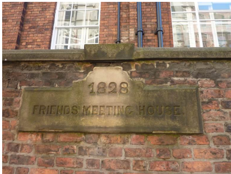
Figure 5. Stone panel in the precinct wall

The front boundary wall is ashlar surmounted by replacement steel railings to Mount Street; these walls return along the sides of the forecourt, with stone piers. From this point they continue around the site in brick laid in Flemish bond with stone copings. On the south side the wall incorporates a stone panel with the date 1828.