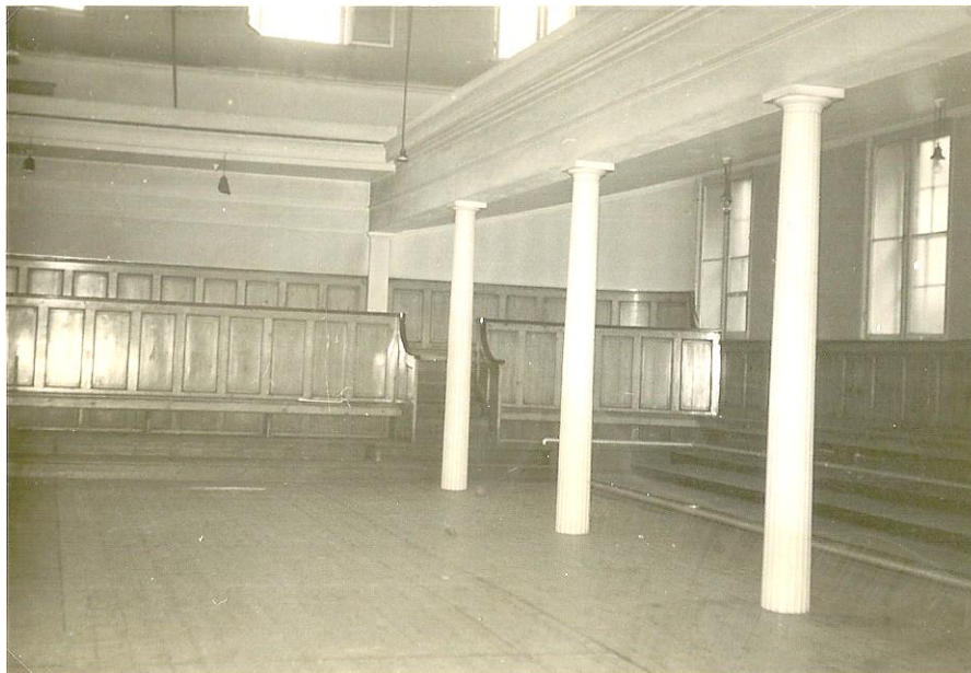
Figure 2. The main meeting room before alteration

The building was altered in the 1860s, when Alfred Waterhouse, a member of the Manchester Friends, designed small-scale alteration, although it is not known exactly what was done. The work may have included the partial infilling of the original entrance to provide doorways, and the projecting addition to the basement on the south side for WCs. The first major phase of alterations took place in 1923 to designs by Hunter, Cruickshank & Seward. The women's meeting room was subdivided horizontally and vertically to create a central concourse, new staircase and a series of smaller rooms on both floors. A new small meeting room was provided on the north-east side of the ground floor. The work was undertaken to accommodate the Friends' Institute and the Friends' Byrom Street school. The original staircases and the vertically-sliding screen between the meeting rooms were removed, although the lifting mechanism for the latter was left in the roof space. Externally, some of the sash windows were widened and steel windows installed to provide more light. The basement was adapted and used for employment projects during the 1930s.