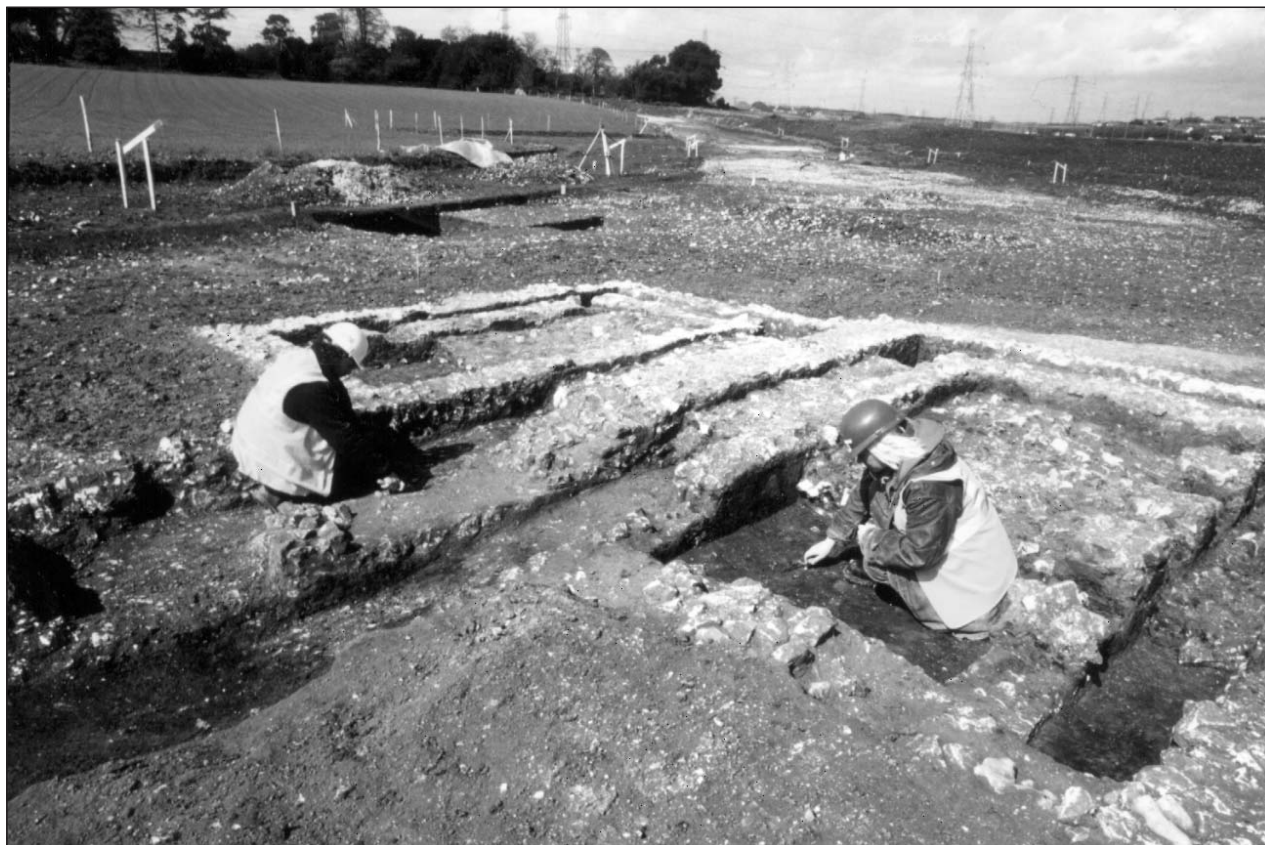
Plate 17: Roman corn dryer/malting oven (group 40500)