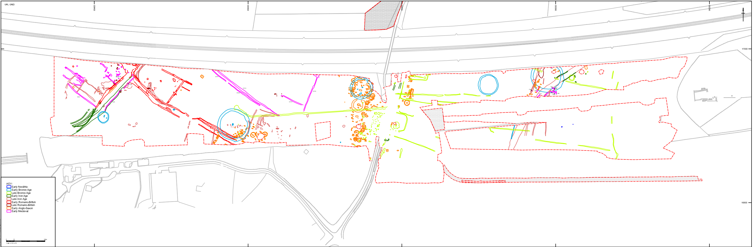
Figure 11: Medieval remains