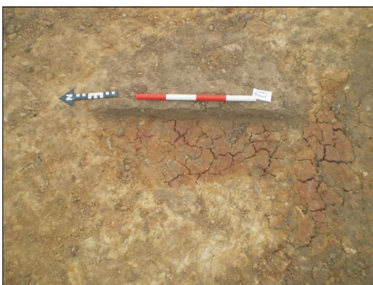
Plate 7: South-west facing section of post hole 237010