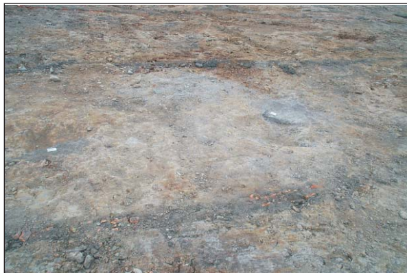
Plate 4: SM 2037, general view of site from south-west