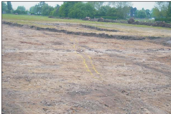
Plate 3: SM 2037, general view of site from south-east