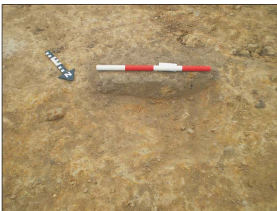
Plate 6: North facing section of post hole 237004