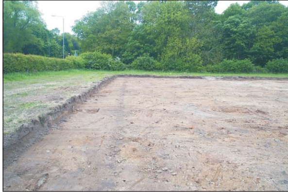
Plate 2: SM 2037, general view of site from north-east