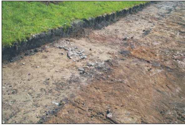
Plate 1: Working shot of SM 2037 showing stone surface exposed in Trench 1198