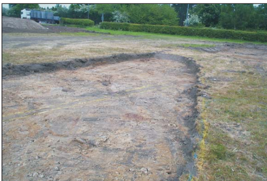
Plate 5: SM 2037 , general view of site from north-west