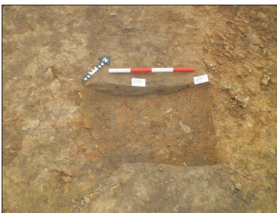
Plate 8: South-east facing section of ditches 237002 and 273012