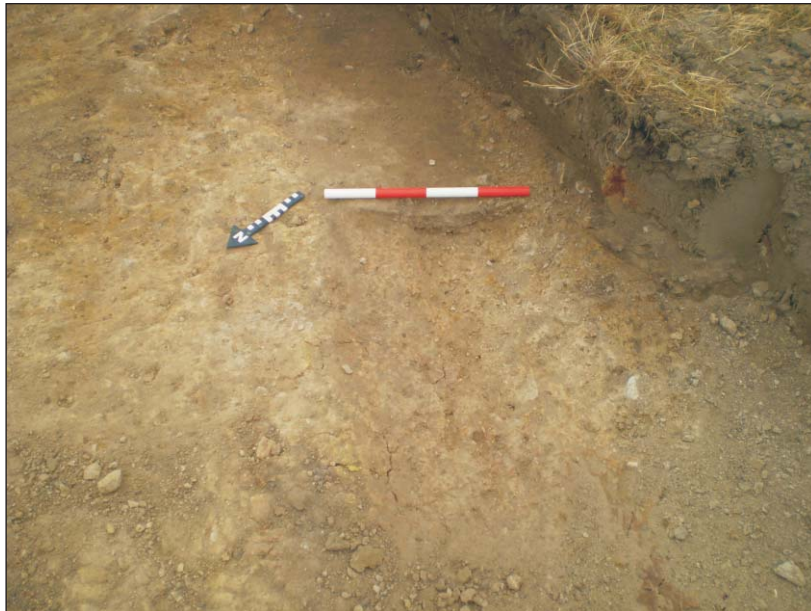
Plate 9: South-east facing section of ditches 237002 and 273012