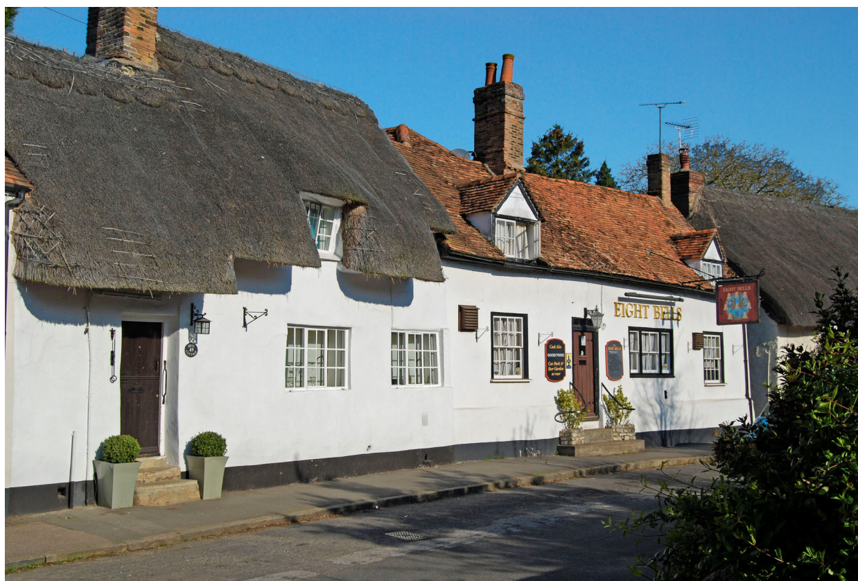
Fig. 1. View from the south.

© N W Alcock and contributors 2012. Copyright in this document is retained under the Copyright, Designs and Patents Act 1988, with all rights reserved including publication. Copyright in illustrations is reserved to the original copyright holder.