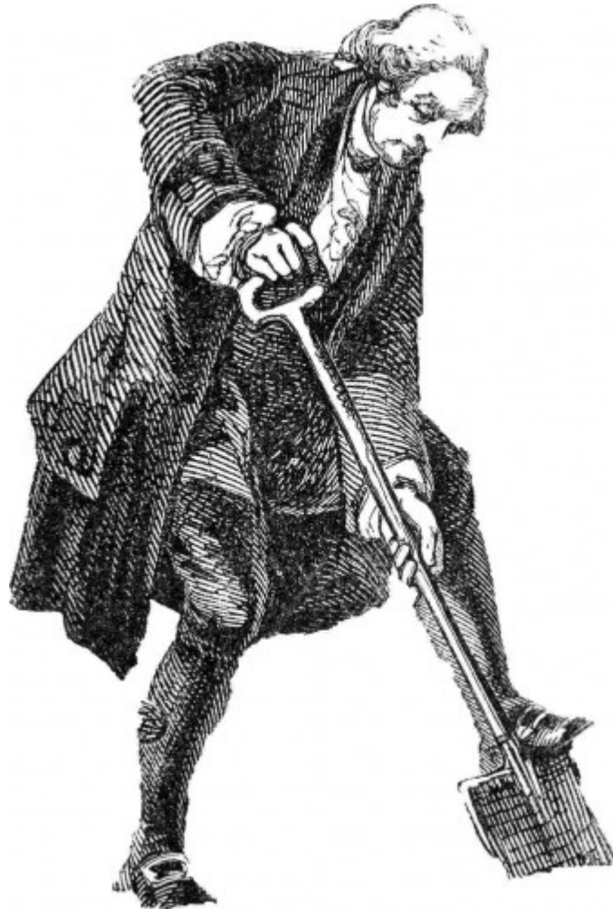
George Washington excavating!