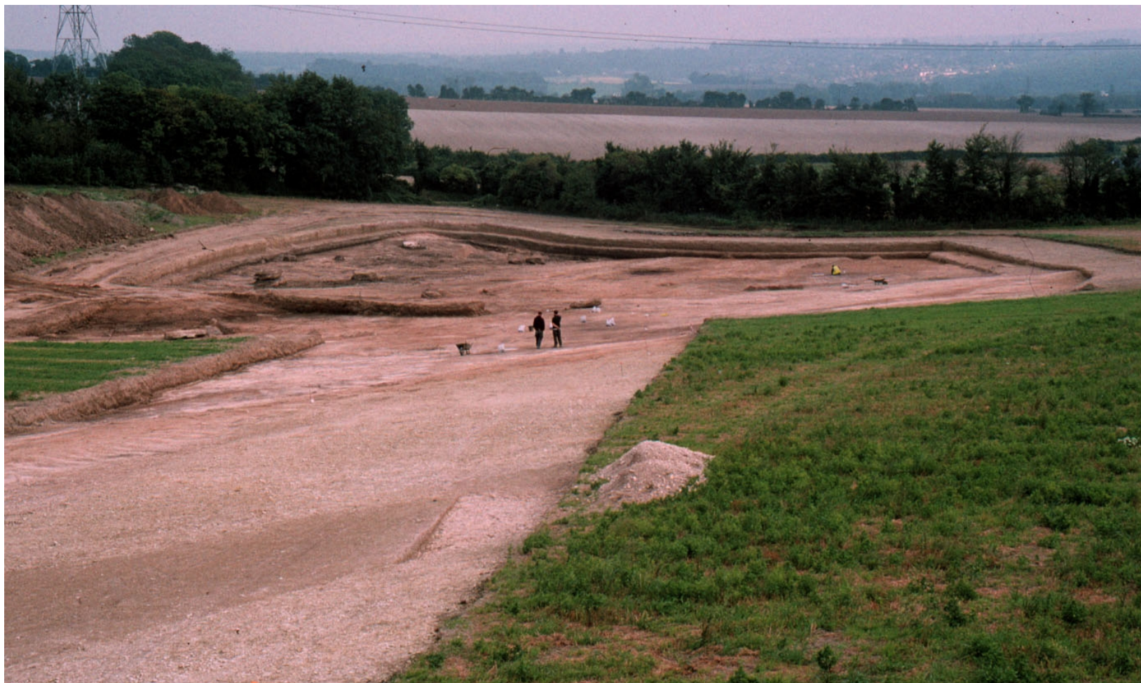
Plate 1: Lower slopes of White Horse Stone dry valley under excavation (view south)