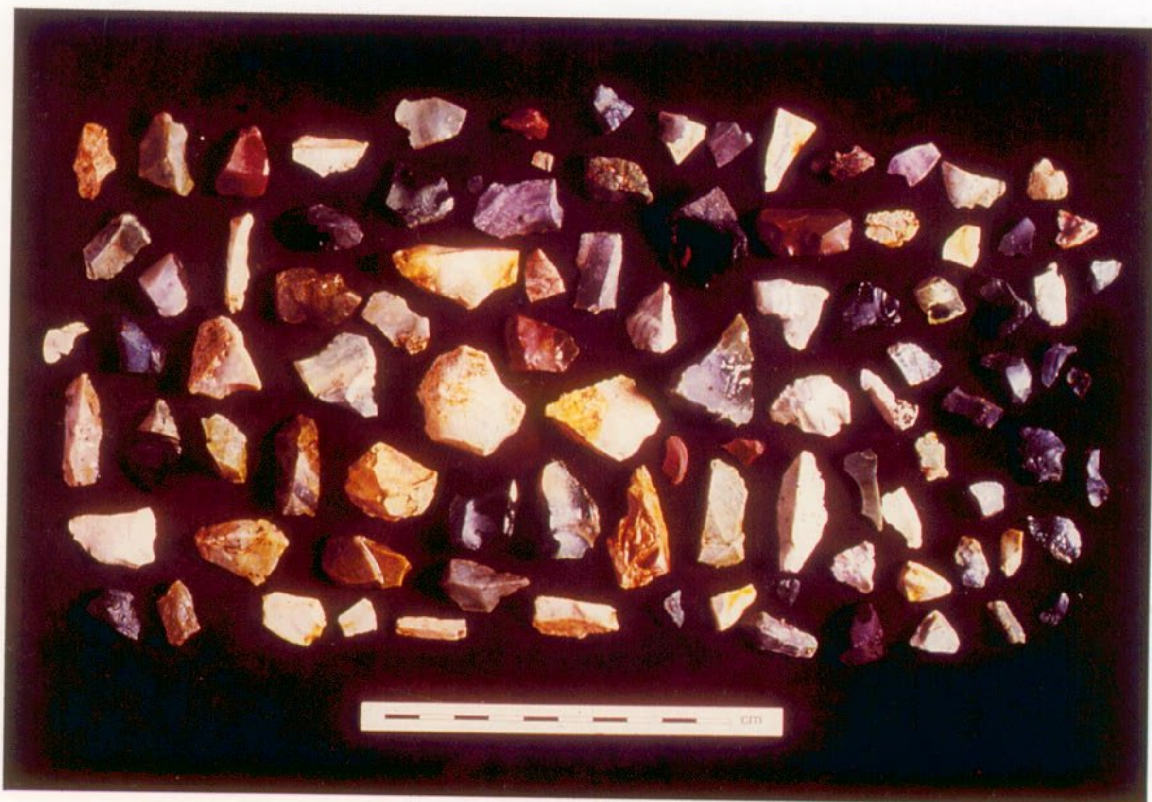
Frontispiece: A selection of lithic debris from the site at Kinloch illustrating the variety of raw material used.