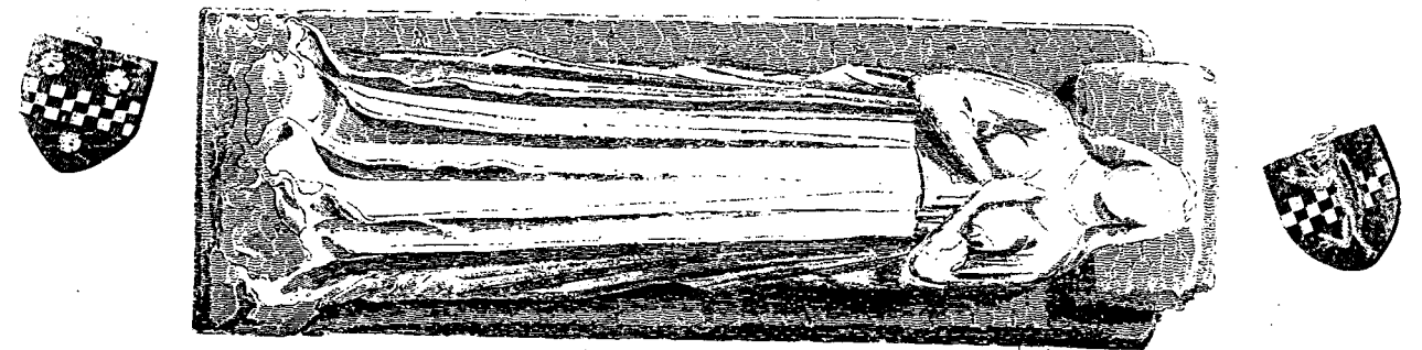
Queen Bleary's Tomb.