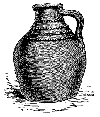
Earthen Jar containing Coins; found at Kinghorn.

"They were found while levelling some ground close to the old mansion-house of Abden, which, though probably not in its present form of an older date than the beginning of last century, occupies the site of much older buildings; and on the spot, or near it, the early Scottish kings possessed a hunting-seat. The workmen engaged in removing the earth a few yards to the south of the Edinburgh, Perth, and Dundee Railway, found an earthenware vessel, something like the accompanying figure. Thinking it a stone, they struck it with a pick, and some coins falling out, in the scramble that