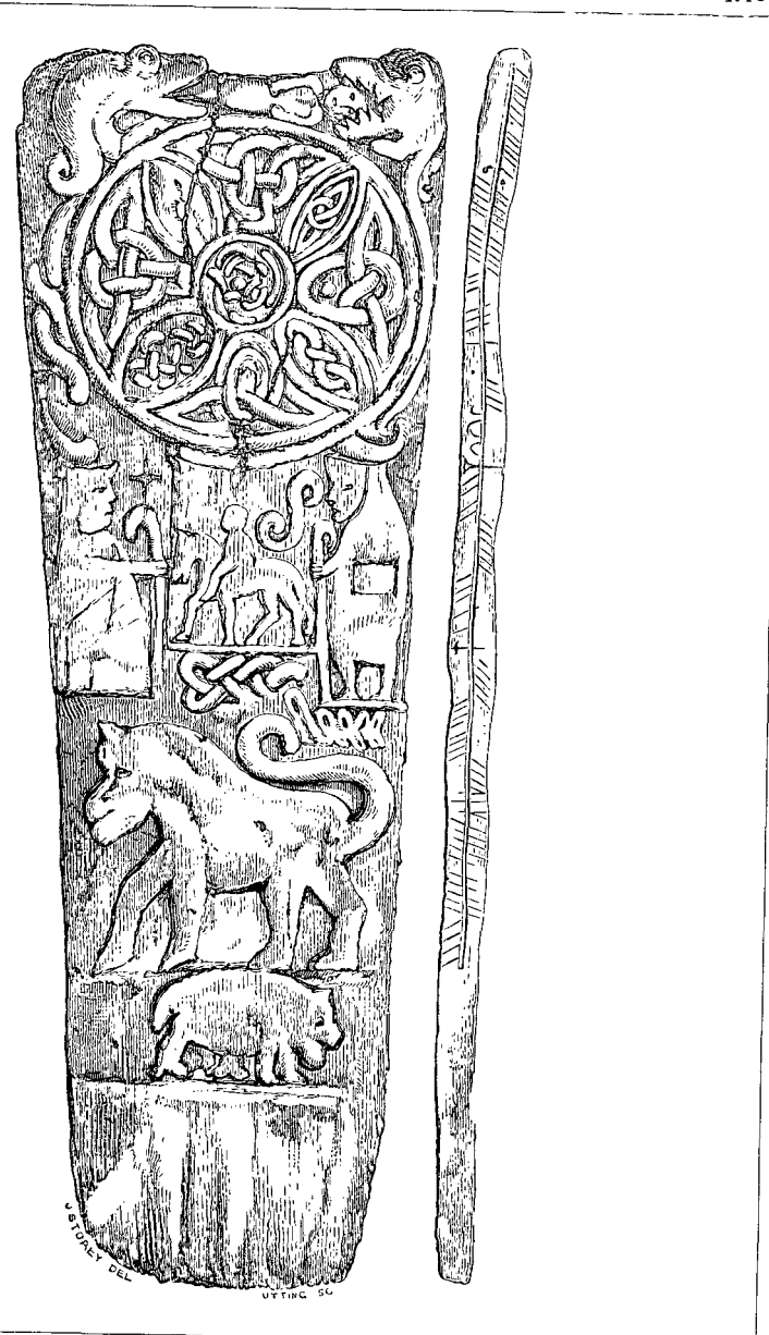
SCULPTURED STONE, WITH OGHAM INSCRIPTION, FOUND AT BRESSAY, SHETLAND Now in the Museum of the Antiquaries of Scotland.