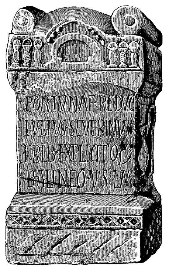
Fig. 3. Roman Altar, from Risingham.