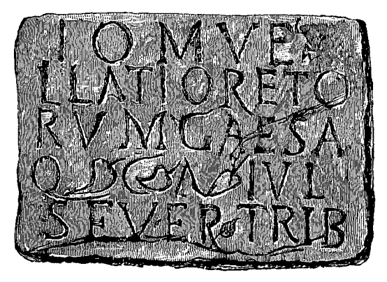
Fig. 1. Stone with Roman Inscription in Jedburgh Abbey (21 by 15 inches).

I need hardly say that Raetorum is a rustic spelling for Rhaetorum . It is interesting to find in Jedburgh at the present day traces of men