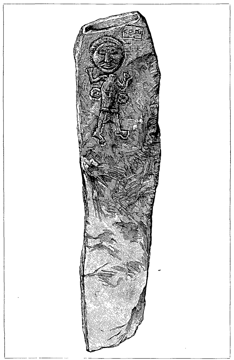
Fig. 2. Sculptured Stone from Over-Kirkhope, in Ettrick (4 feet in length).